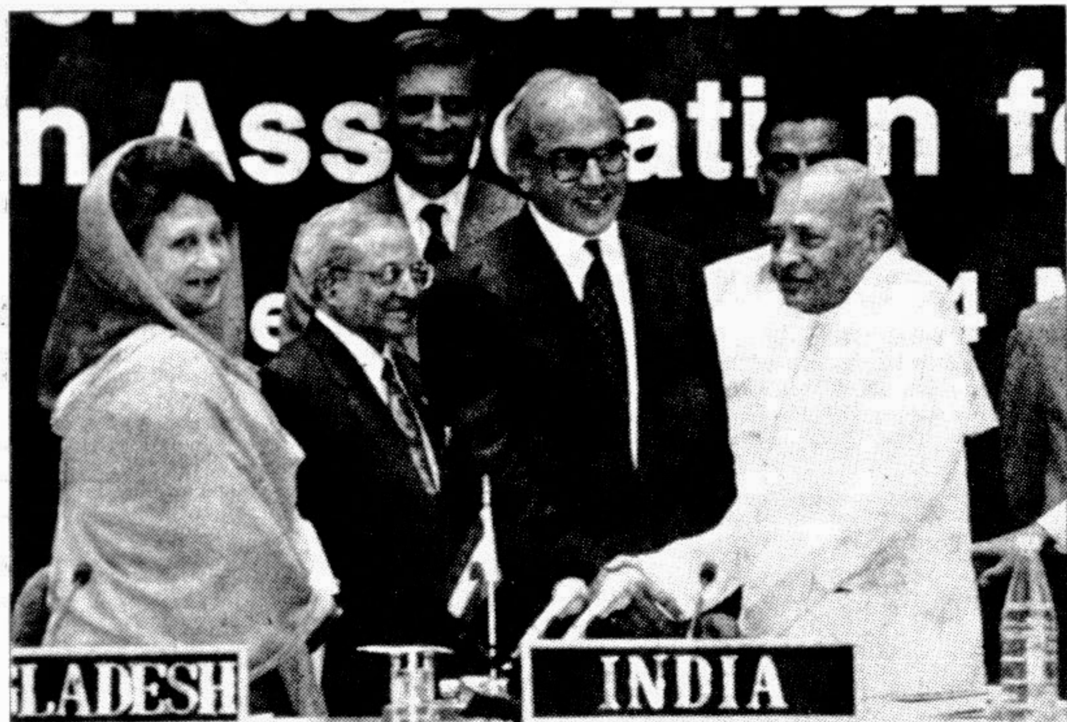
Indian Prime Minister P V Narasimha Rao (R) shakes hands with Pakistan President Farooq Ahmed Leghari, Bangladesh Prime Minister Begum Khaleda Zia and Maldives President Maumoon Abdul Gayoom seen standing by during the closing session of the SAARC summit in New Delhi yesterday.

NEW DELHI, May 4: Indian Prime Minister P V Narasimha Rao said today that a solution to the complex issue of the sharing of water between his country and Bangladesh would hopefully be found in the near future, reports BSS. Replying to questions at the post-summit press conference as the new Chairperson of SAARC, he said the issue was discussed at the bilateral meeting with Bangladeshi Prime Minister Begum Khaleda Zia here yesterday evening and added that details of the matter would be discussed at other levels. Rao, however, denied that failure to reach an agreement on the issue amounts to denial by India of human rights to Bangladeshis and observed that both countries had their share of the blame in the present situation. He said it would not be proper to blame India for the situation since "availability" of water is also linked with the matter. Rao said, following discussions with the Bangladesh Prime Minister the efforts would increase for a solution of the issue. See Page 12 Col 4