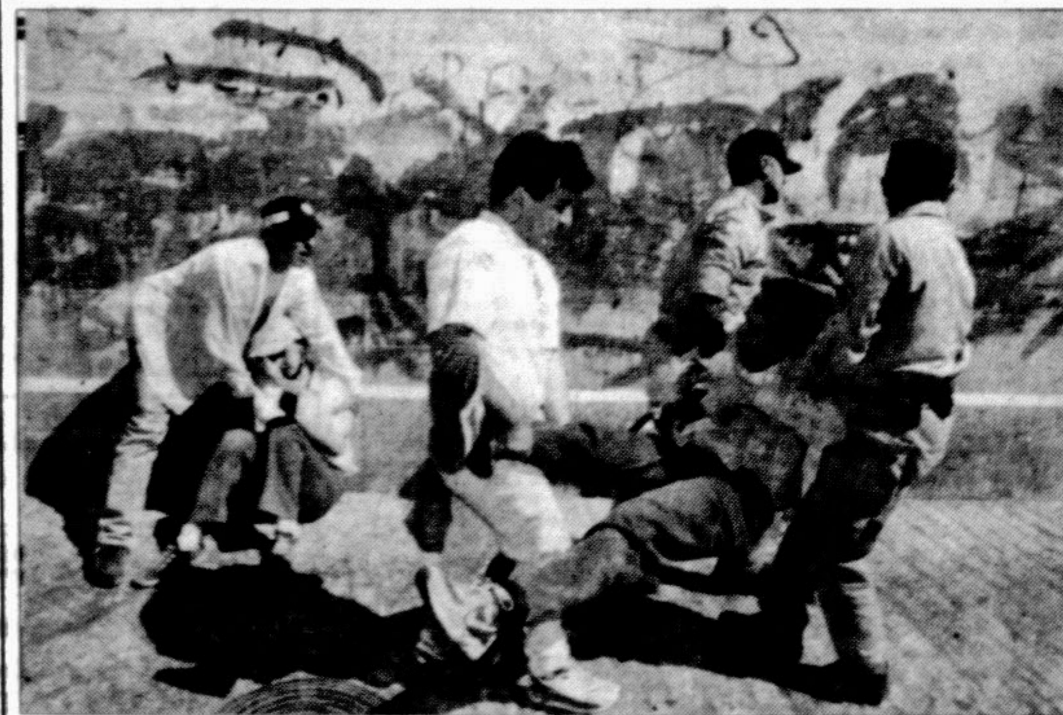
Israeli policemen arrest Jewish far-right nationalists who tried to force their way into the Al-Aqsa mosque compound in Jerusalem as Israel celebrated its 47th Independence Day yesterday.

By Staff Correspondent The Ganatantrik Oikya Parishad (GOP) has won all the 25 posts of registered graduates' representatives to the Dhaka University Senate, according to unofficial results of the election available yesterday. A total of 6336 registered graduates from across the country elected the 25 representatives for a three-year tenure. Candidates from three panels — GOP (supporters of the Awami League and left parties), White (supporters of the BNP) and third one comprising supporters of Jamaat-e-Islami and Jatiya Party — contested the elections. See Page 12 Col 8