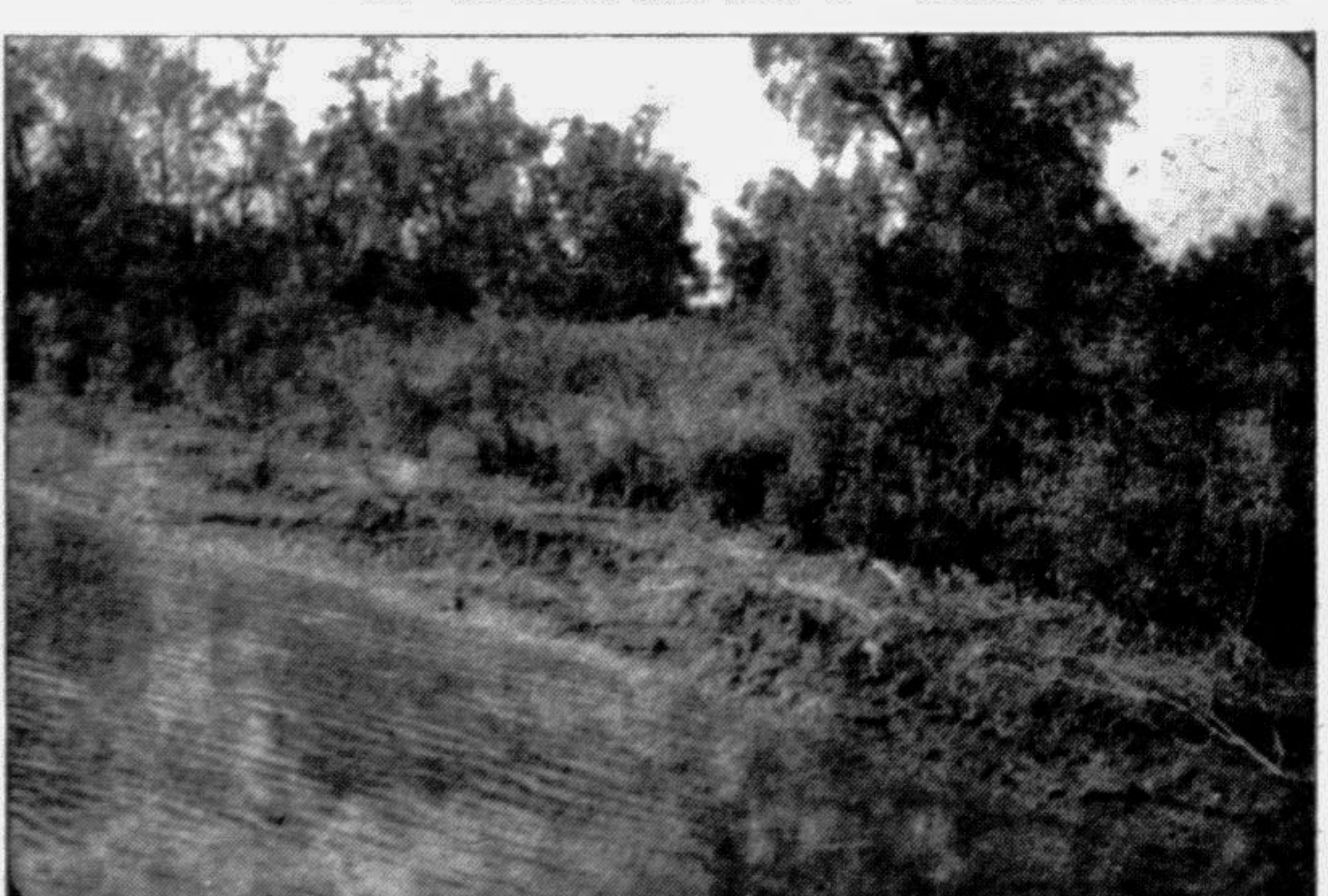
Partial view of forest in Sundarbans.

In an another incident, three businessmen who were taken hostage by some armed miscreants were later, re-