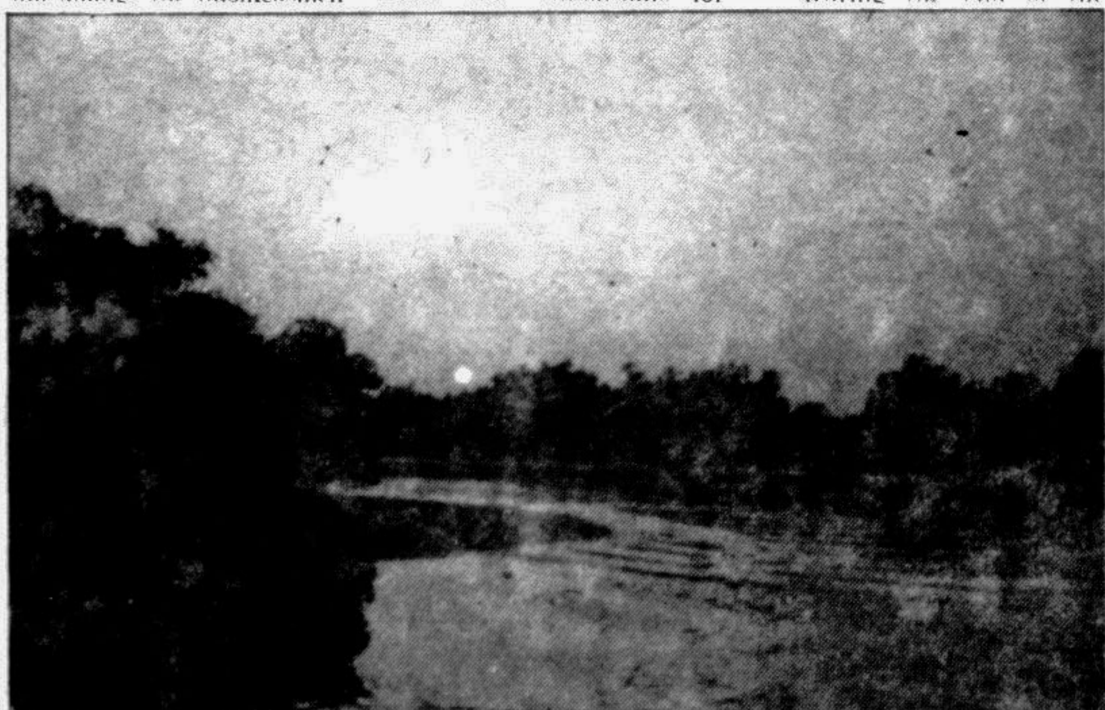
A scene of sunset in Sundarbans.

Beside, there are so many beasts, deer, birds, snakes and monkeys. 'Chitral deers' are very beautiful and famous for their beauty. Thus, it is said, Sundarbans still beautiful with its natural beauty and beasts.