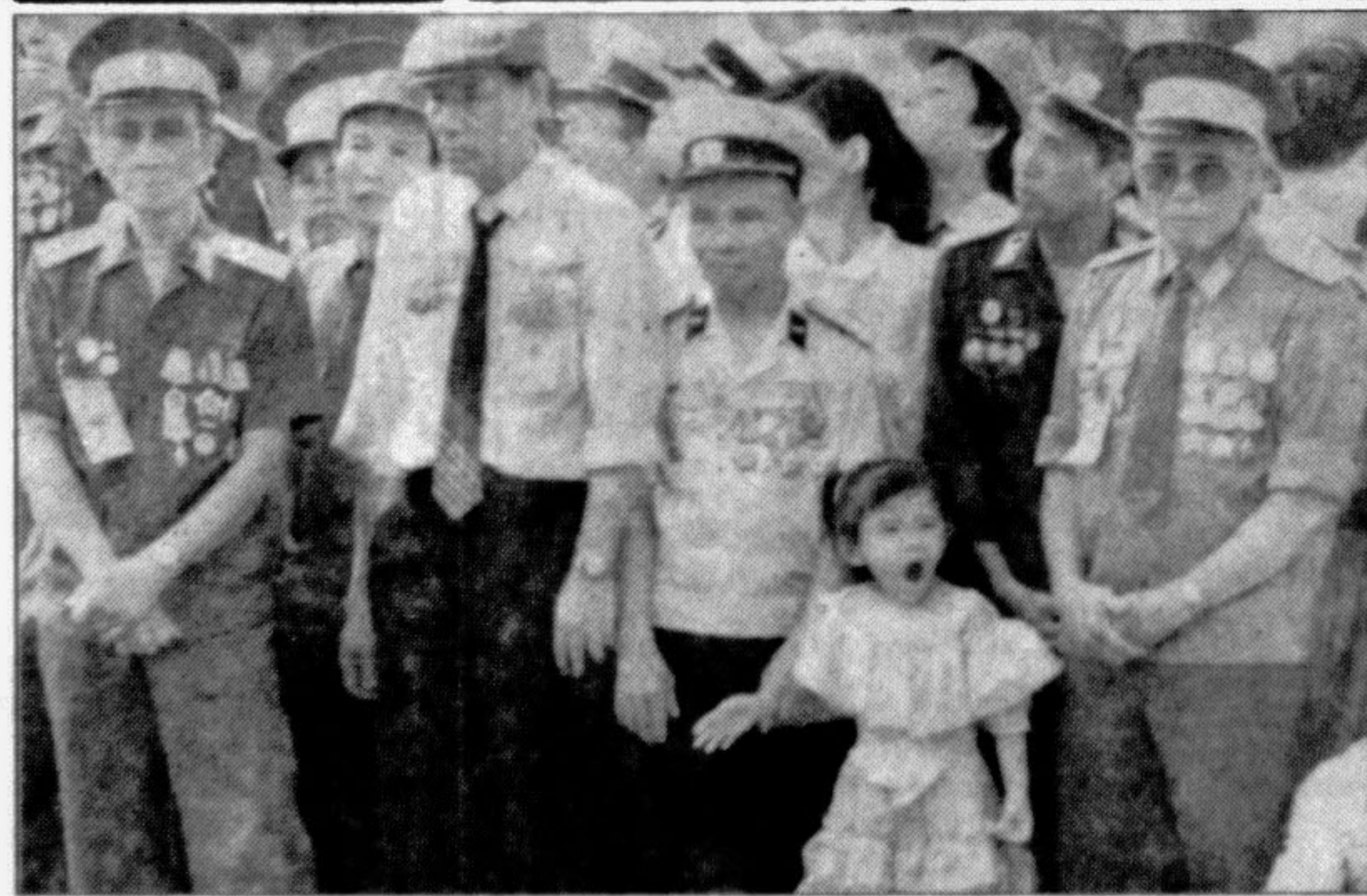
A young girl yawns as she watches the parade yesterday marking the 20th anniversary of the end of the Vietnam War alongside Vietnamese war veterans.