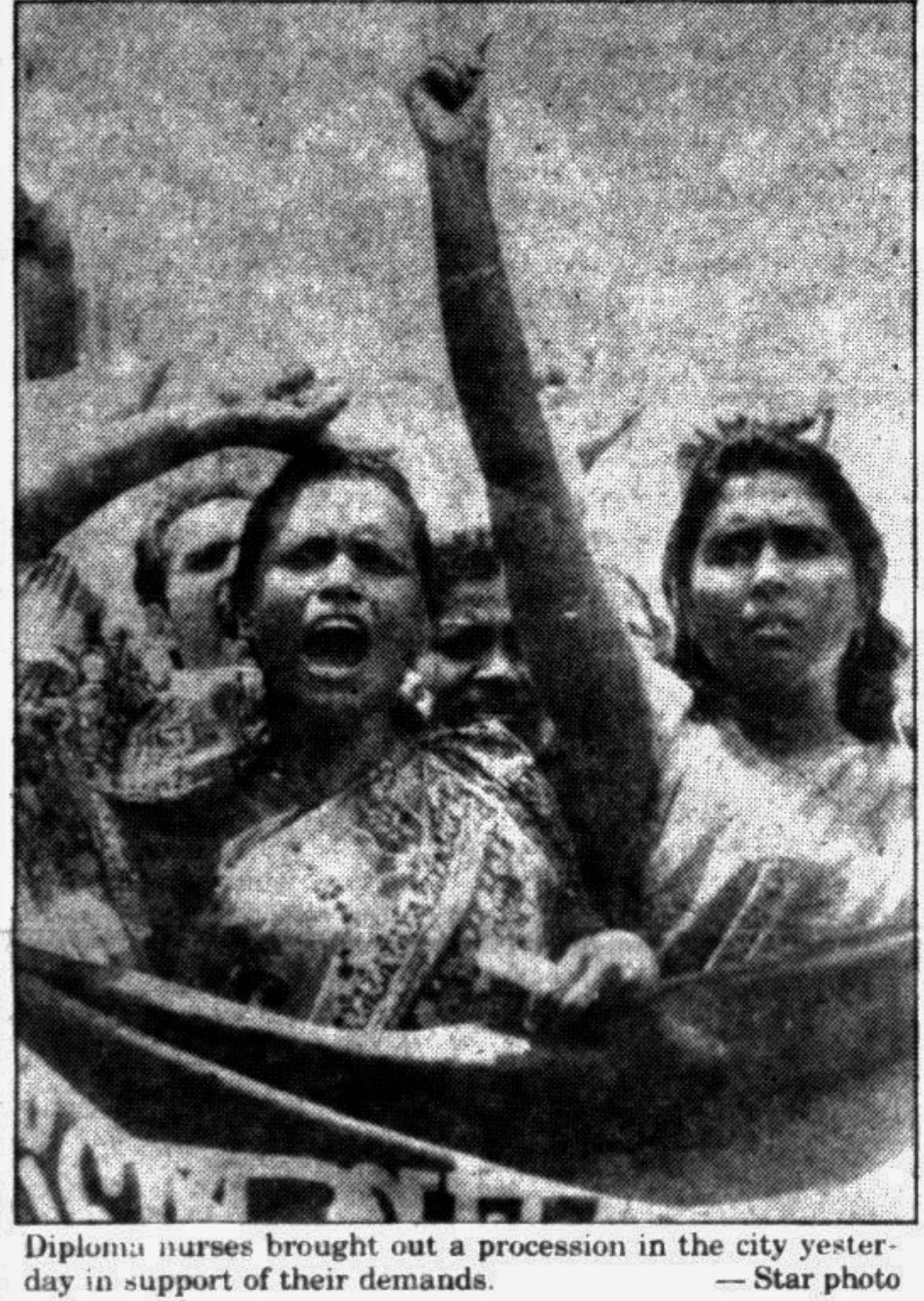
Diploma nurses brought out a procession in the city yesterday in support of their demands.