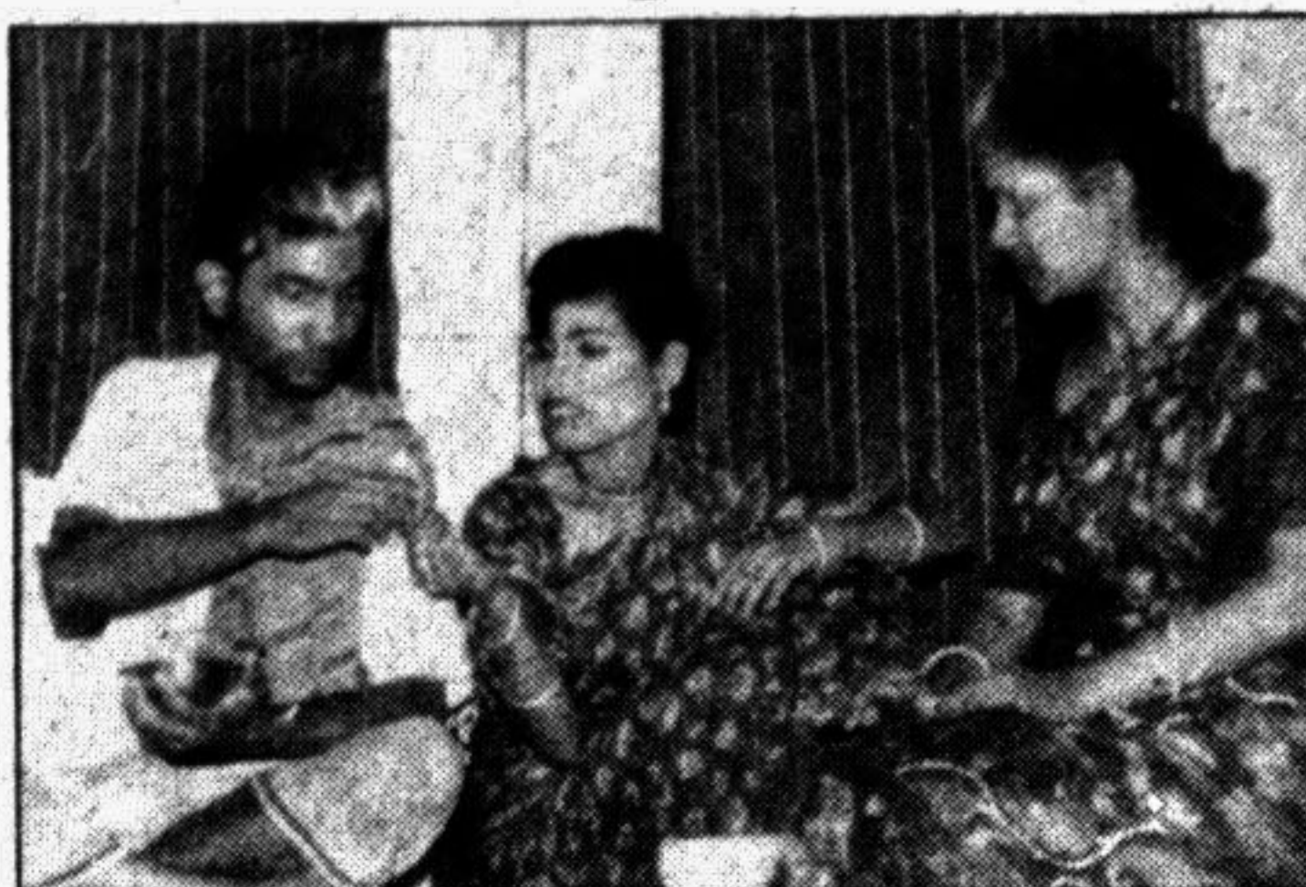
A sequence from the mime show 'Sonai Madhab' staged by the members of the Society for the Deaf at its auditorium in the city yesterday.

BBC Bengali Service will broadcast a special live programme on Monday, participated by film star Champa, football player Munna and writer Imdadul Haque, reports UNB. This programme will be broadcasted at 8:10 pm on 100 Mhz. FM. for the listeners in Dhaka city and its suburbs.