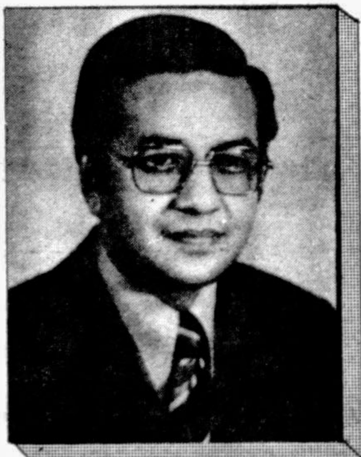
HIS EXCELLENCY THE PRIME MINISTER OF MALAYSIA DATU' SERI DR. MAHATHIR BIN MOHAMMAD.

Branches : ● Chittagong ● Khulna ● Bogra ● Kulaura