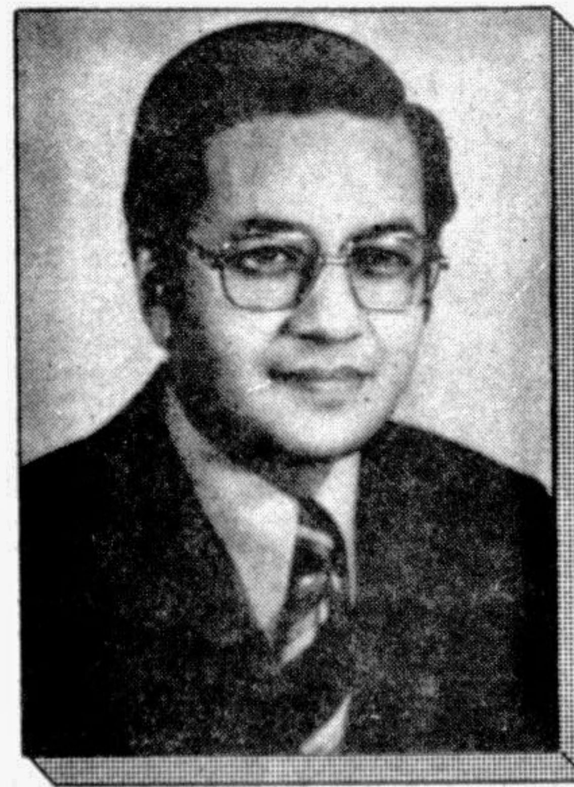
HIS EXCELLENCY THE PRIME MINISTER OF MALAYSIA DATU' SERI DR. MAHATHIR BIN MOHAMMAD.

HOUSE NO. C-138, ROAD NO. 4, BANANI DHAKA-1213, BANGLADESH PHONE : 608915, TLX : 632555 T-CON BJ, FAX : 880-2-886641