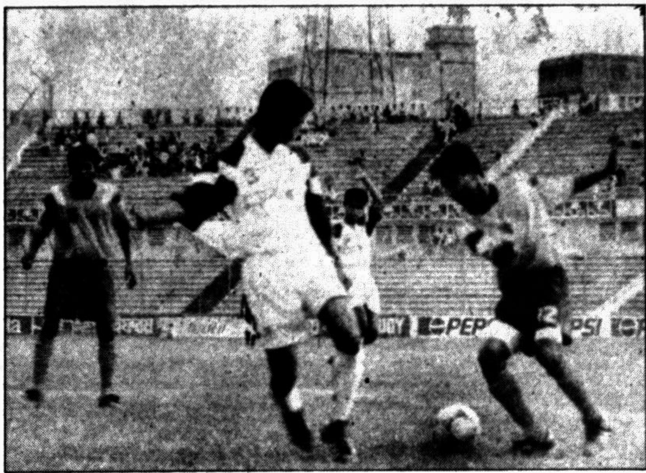
A midfield tussle from yesterday's Nirma DMFA Cup football tournament match between East End Club and Bangladesh Boys Club at the Dhaka Stadium. East End won 4-2 in the tiebreaker.

Kinnear was fined 1,500 pounds (2,400 dollar) and banned from the sidelines until Oct 31 for calling one referee a "cheat" and another a "little Hitler" after separate defeats earlier this season.