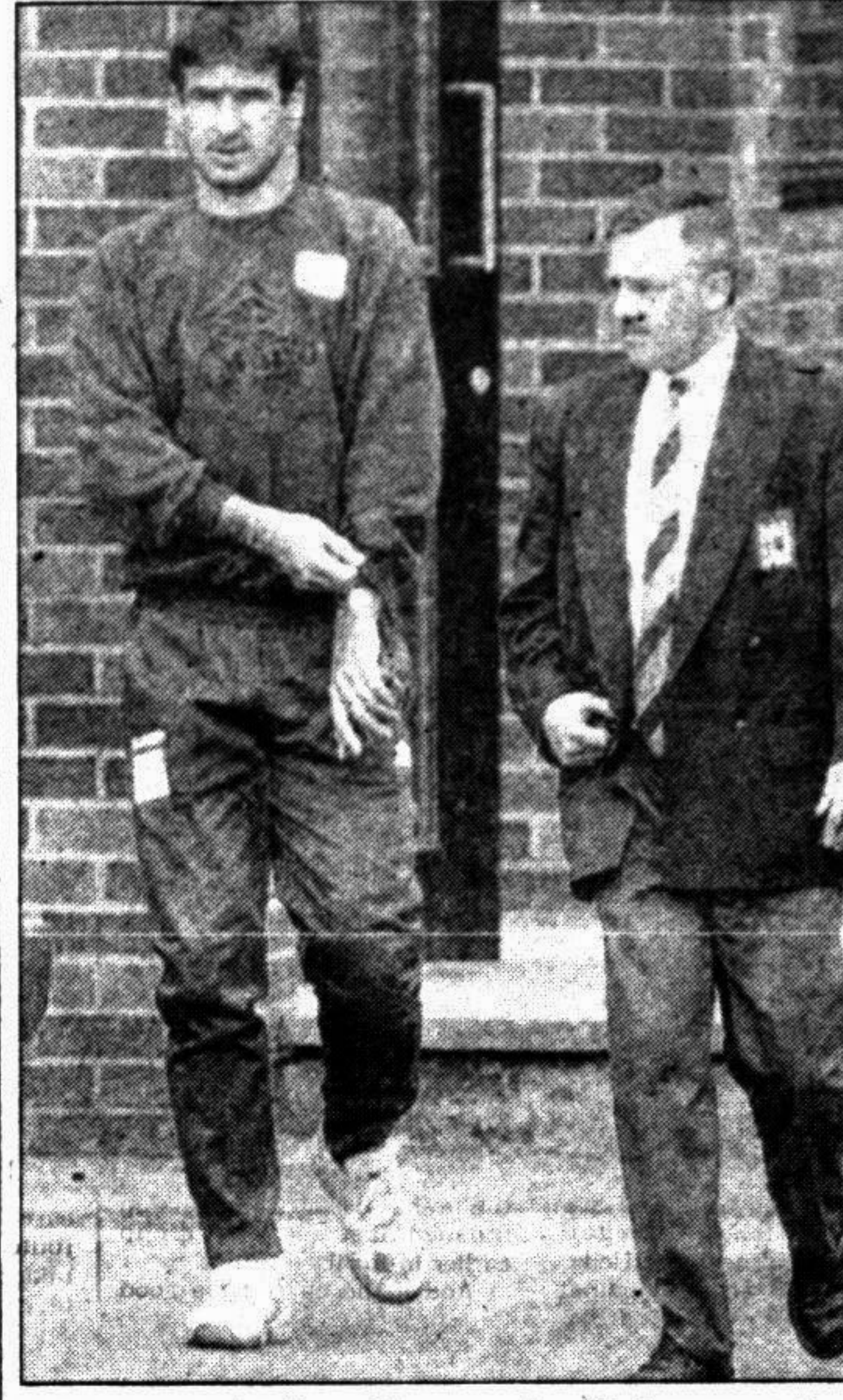
Eric Cantona walks with an unidentified man at the Manchester United's training ground on April 27. The controversial French star at a press conference yesterday pledged to stay at the Old Trafford club until 1999.