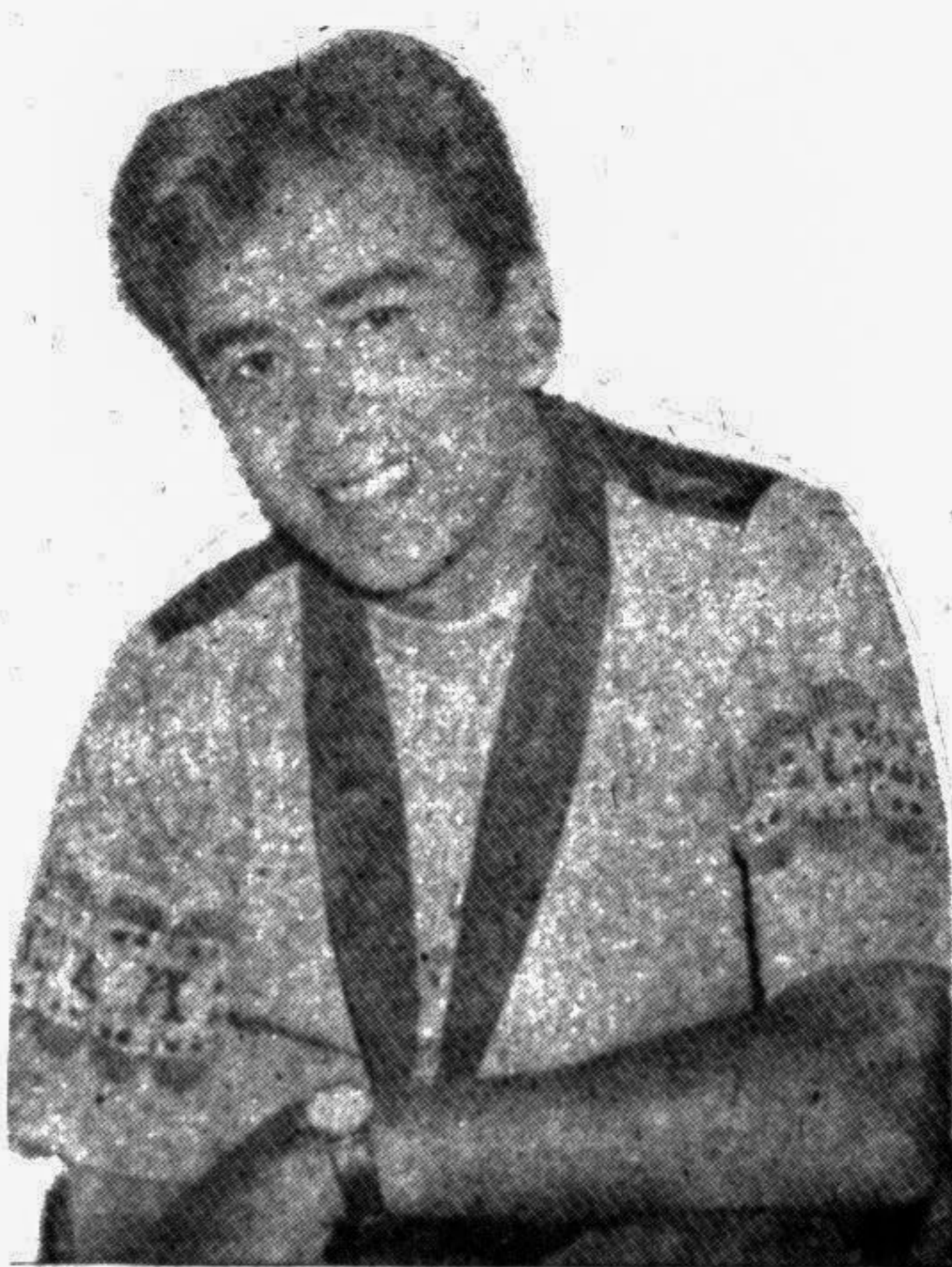
Zahid Hassan 'our' Hearthrob

My next question to him was whether the parents are encouraging those youngsters who want to join in the 'line of acting'. Zahid said, "No, there is always a conviction in their mind that their children have to be a doctor or an engineer. That whole idea is wrong. If parents force their children to do what they do not want to do, the result might be bad. At the same time, youngsters should take it up as a challenge to prove their parents that they are successful in what they desired to be most. "I'm sure then the parents would be happy again. Even in my initial period, my family, specially my parents, were against the idea of me becoming an actor. But they are very happy now."