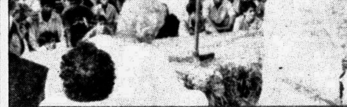
Awami League chief Sheikh Hasina addressed a public meeting at the Aburhat High School ground in Mirersharai thana of Chittagong yesterday.

Meeting over, Begum Zia distributed poultry and cattle among the poor women.