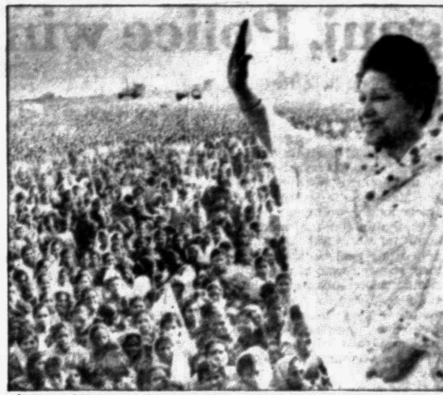
Prime Minister Begum Zia addressed a large public meeting at the Hatiya Island Govt College ground in Noakhali yesterday.

Those who have submitted their demands, objections, recommendations, and opinions, have been requested to be present at the Election Commission Secretariat at 10 am on the above mentioned dates.