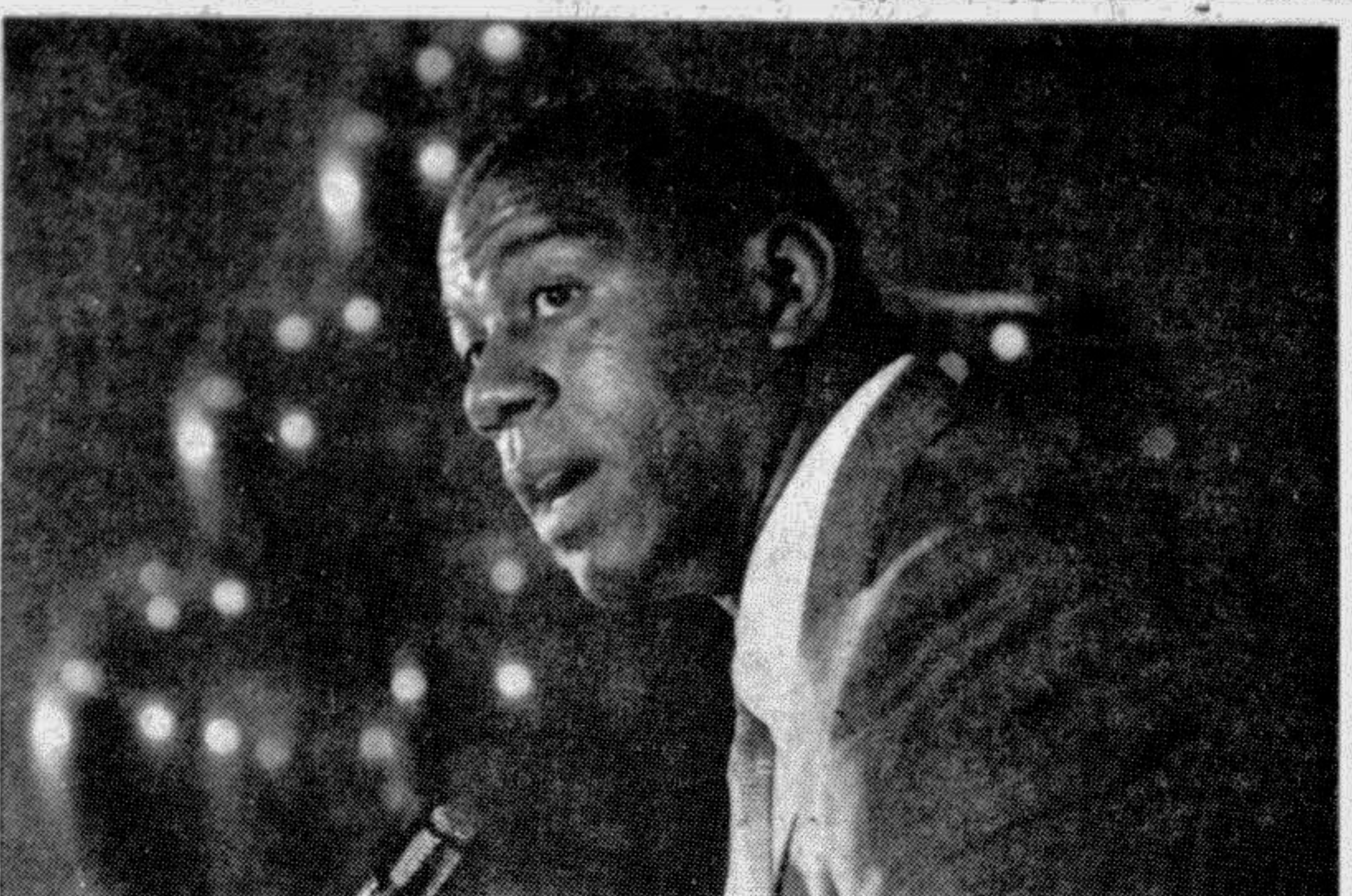
Ervin 'Magic' Johnson announced his plans at a press conference in Long Beach, California on Apr 24, on playing in a summer basketball league with his own team against other NBA players, college and national teams.

MONACO, Apr 25: Riviera rain wiped out the first day of play at the 1.8 million dollars Monte Carlo Open men's tennis tournament on Monday and forecasts suggested the disruption could continue today, reports Reuters. Organisers abandoned all hope of play for the day just after 1430 GMT, more than six hours after the opening matches had been scheduled to start.