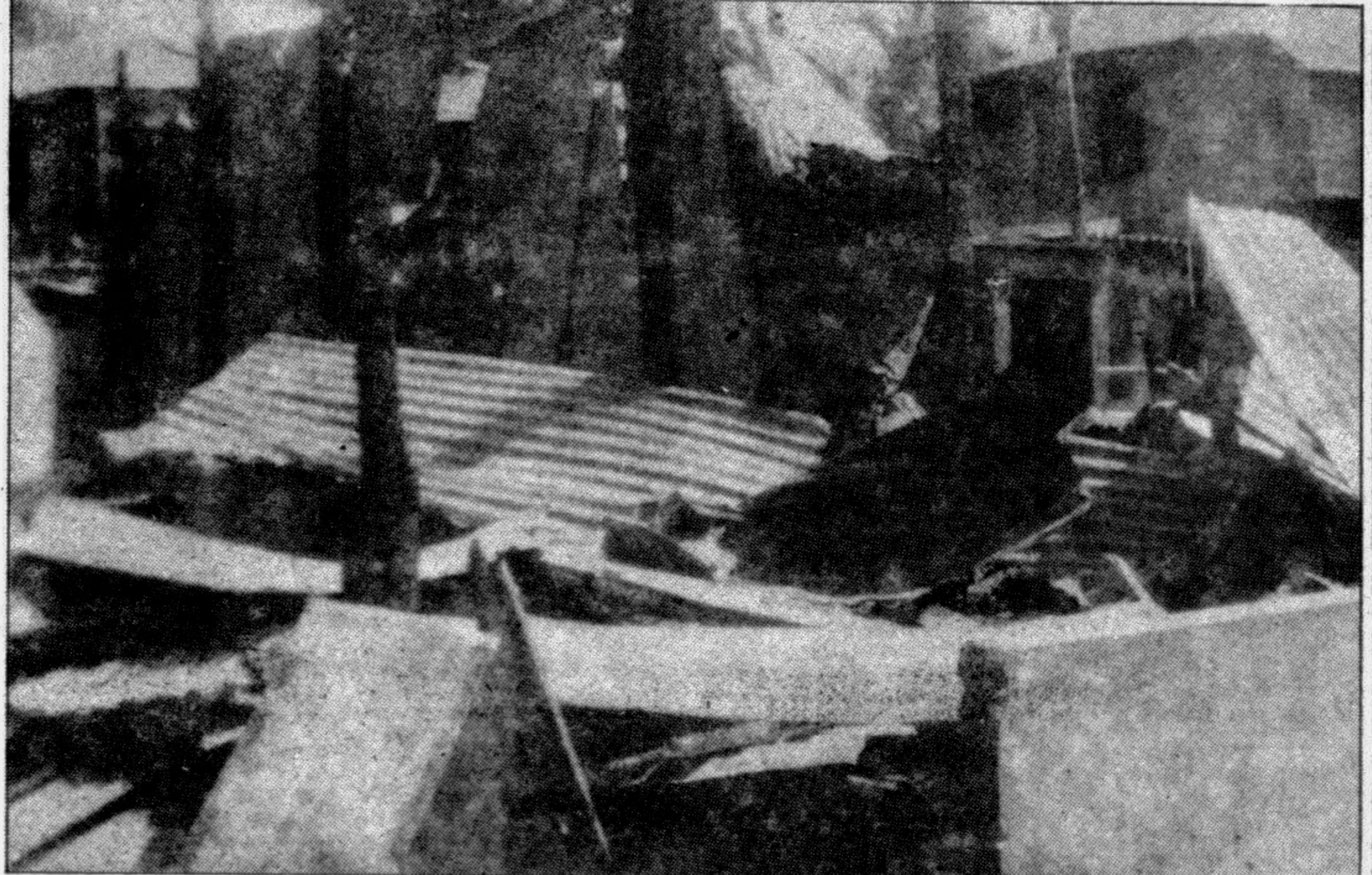
GOPALGANJ: A partial view of fire affected Monohari Patti. The fire, ignited from an electric short-circuit, destroyed property worth Tk one crore.