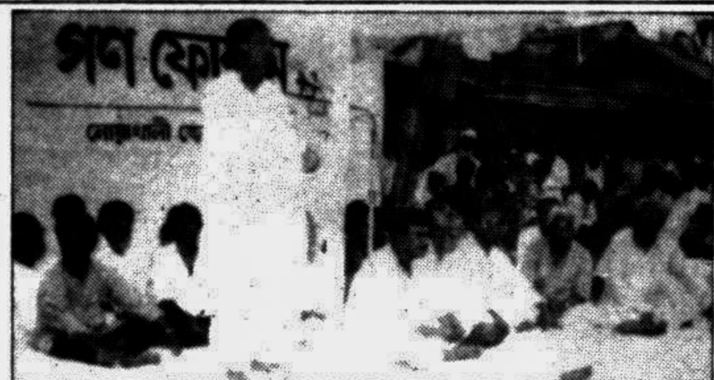
NOAKHALI: Dr. Kamal Hossain, President of Gono Forum, addressing a rally at Town Hall area recently.