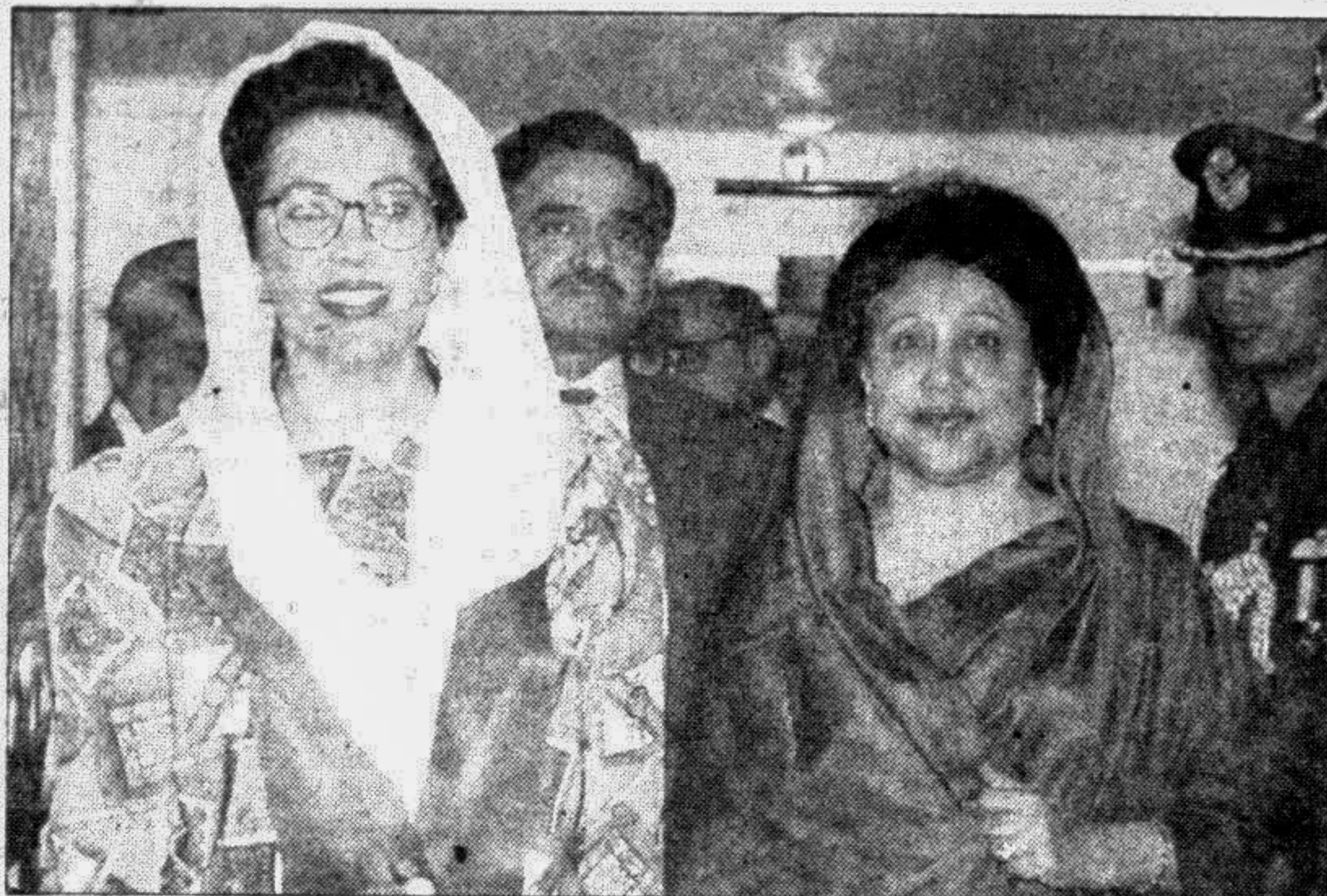
Pakistan Prime Minister Benazir Bhutto paid a courtesy call on her Bangladeshi counterpart Begum Khaleda Zia at her hotel suite in Islamabad yesterday.