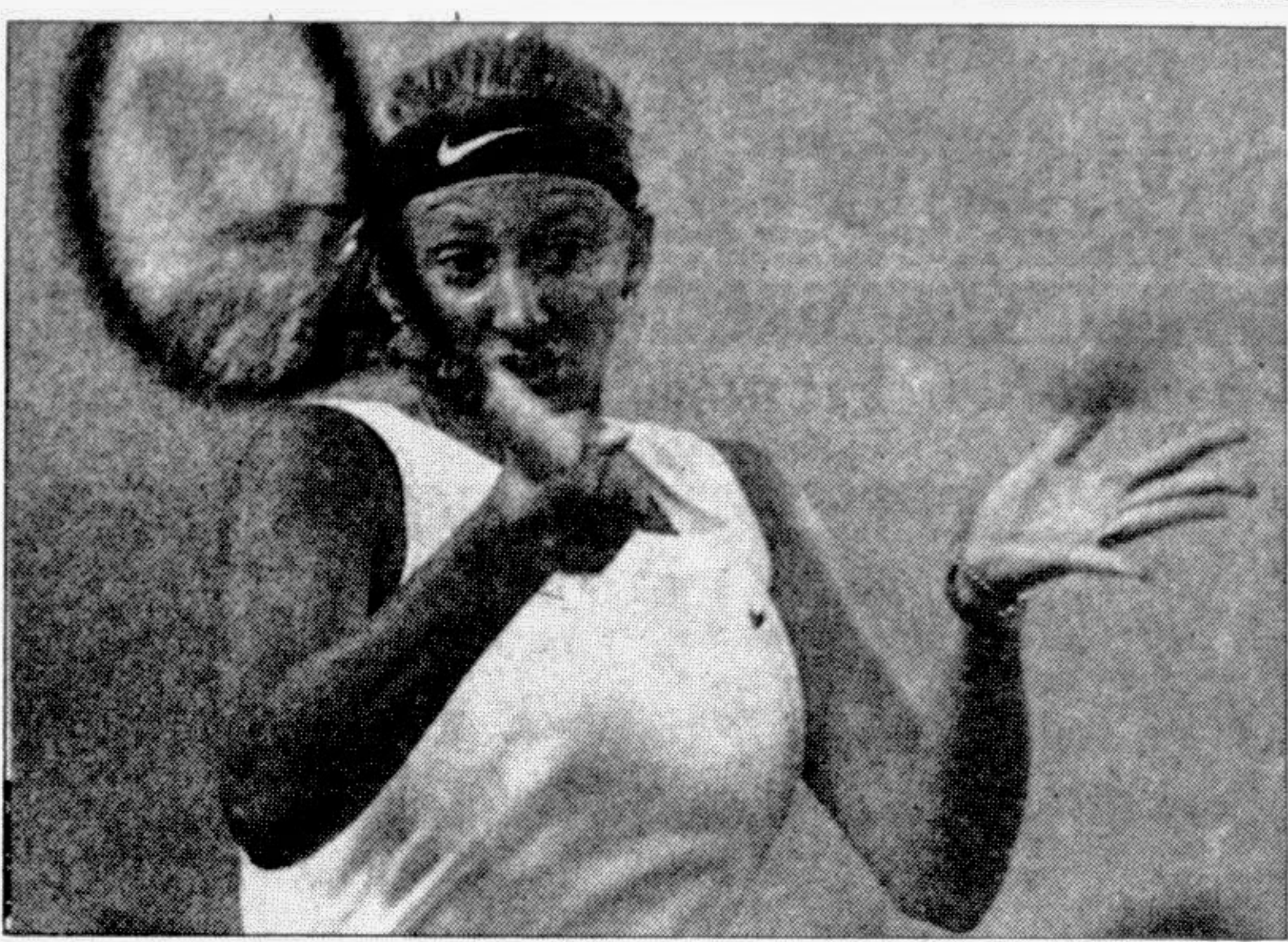
Frenchwoman Mary Pierce makes a forehand return to South African Joannette Kruger during their Federation Cup tie at Metz, France on April 21. Pierce won the match 6-4, 6-3.