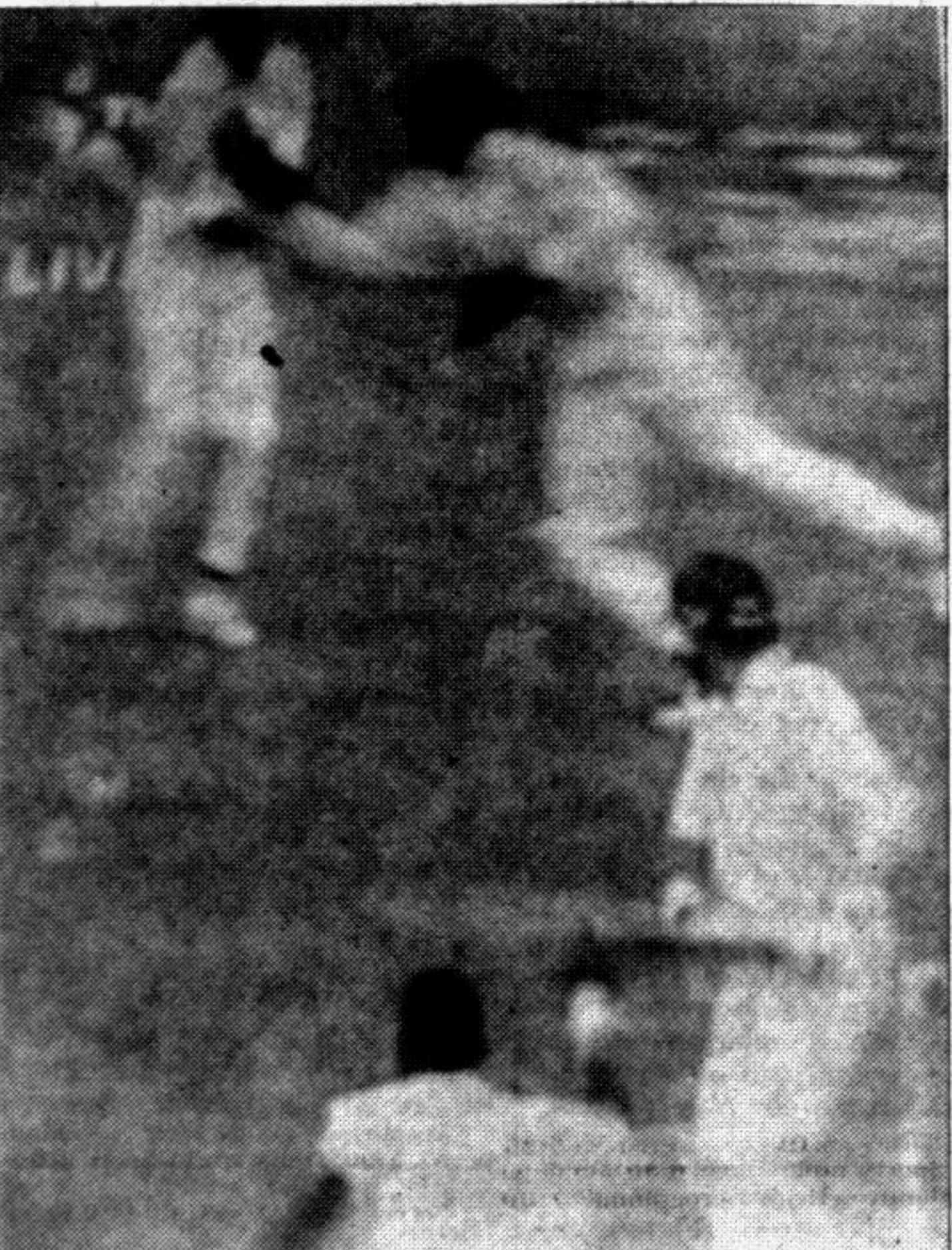
West Indian wicketkeeper Junior Murray takes a spectacular diving catch to send Australia's stylish batsman Mark Waugh to the pavilion during first day's play of the third Test at Trinidad on April 21.