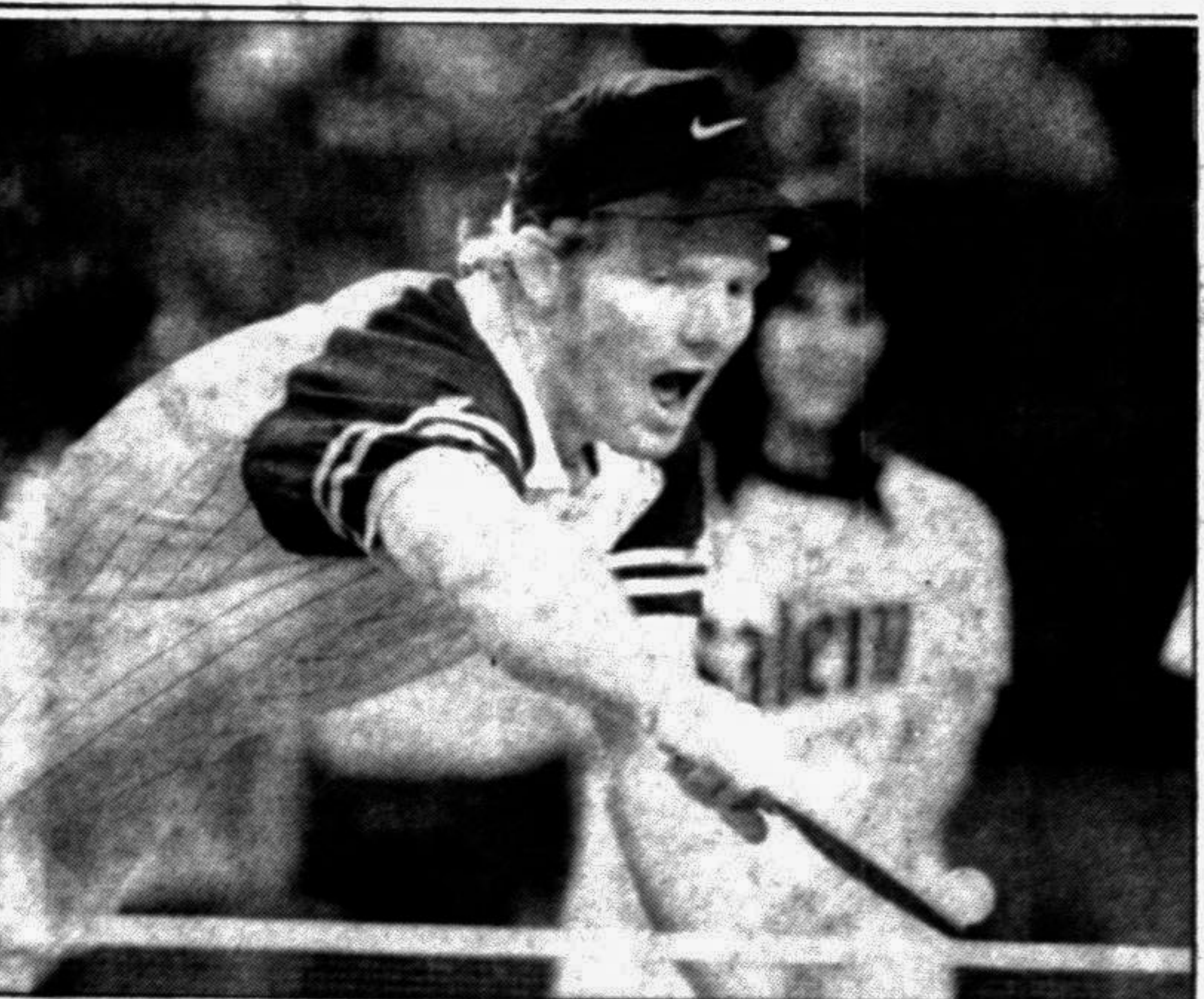
American Jim Courier who is better known for his tennis indulges a completely different ball game — table tennis — against compatriot Michael Chang during the break at the Hong Kong Open on April 20.

his career with a Nov 5 fight against a major opponent such as Riddick Bowe or Michael Moorer. The more immediate business is Schulz, the former East German Army amateur heavyweight who went from a virtual unknown to a major sports figure in Germany after Foreman selected him for the first defence of the title he won from Moorer last November. Schulz, 21-1-1 with 10 knockouts, appears to be ready-made for Foreman. A straight-ahead fighter who doesn't move well and has little power, he has fought only twice outside Germany. Foreman will come forward as he always has, looking for the big punch, while the only chance for Schulz will be to try and keep moving and outbox Foreman from the outside. "I have to be very cautious that I don't get hit too hard," Schulz said through a translator.