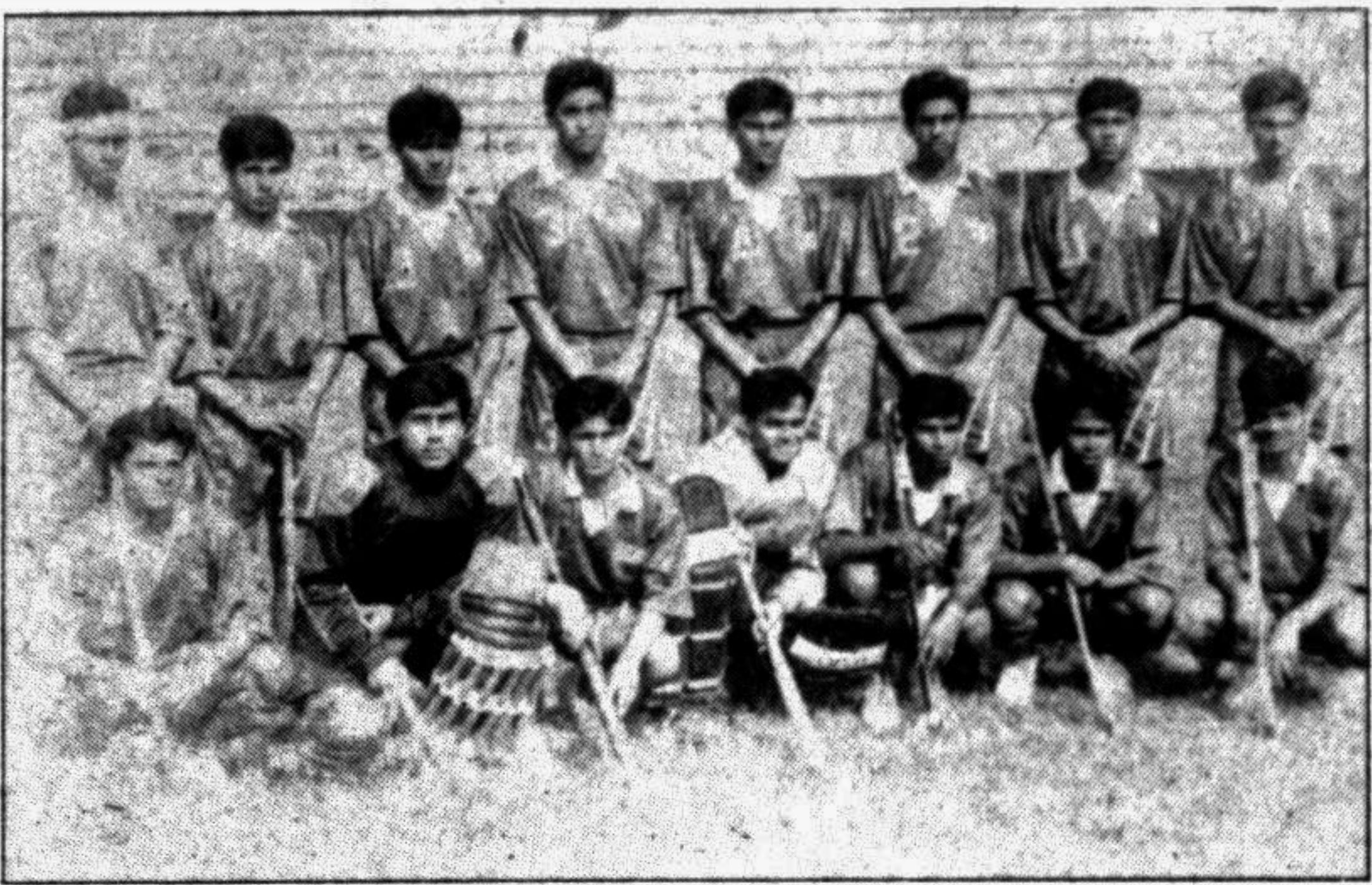
Players of the Bangladesh Kriya Shiksha Protisthan (BKSP) hockey team who retained the national youth championship title for the fourth time at the Hockey Stadium yesterday.