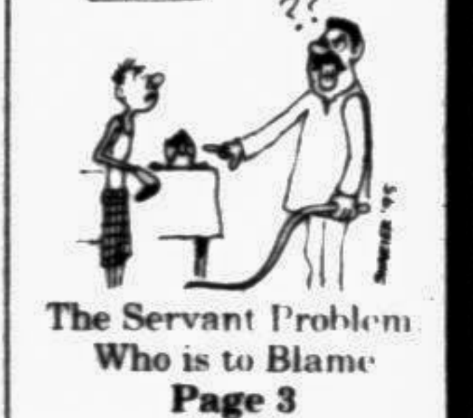
The Servant Problem Who is to Blame? Page 3