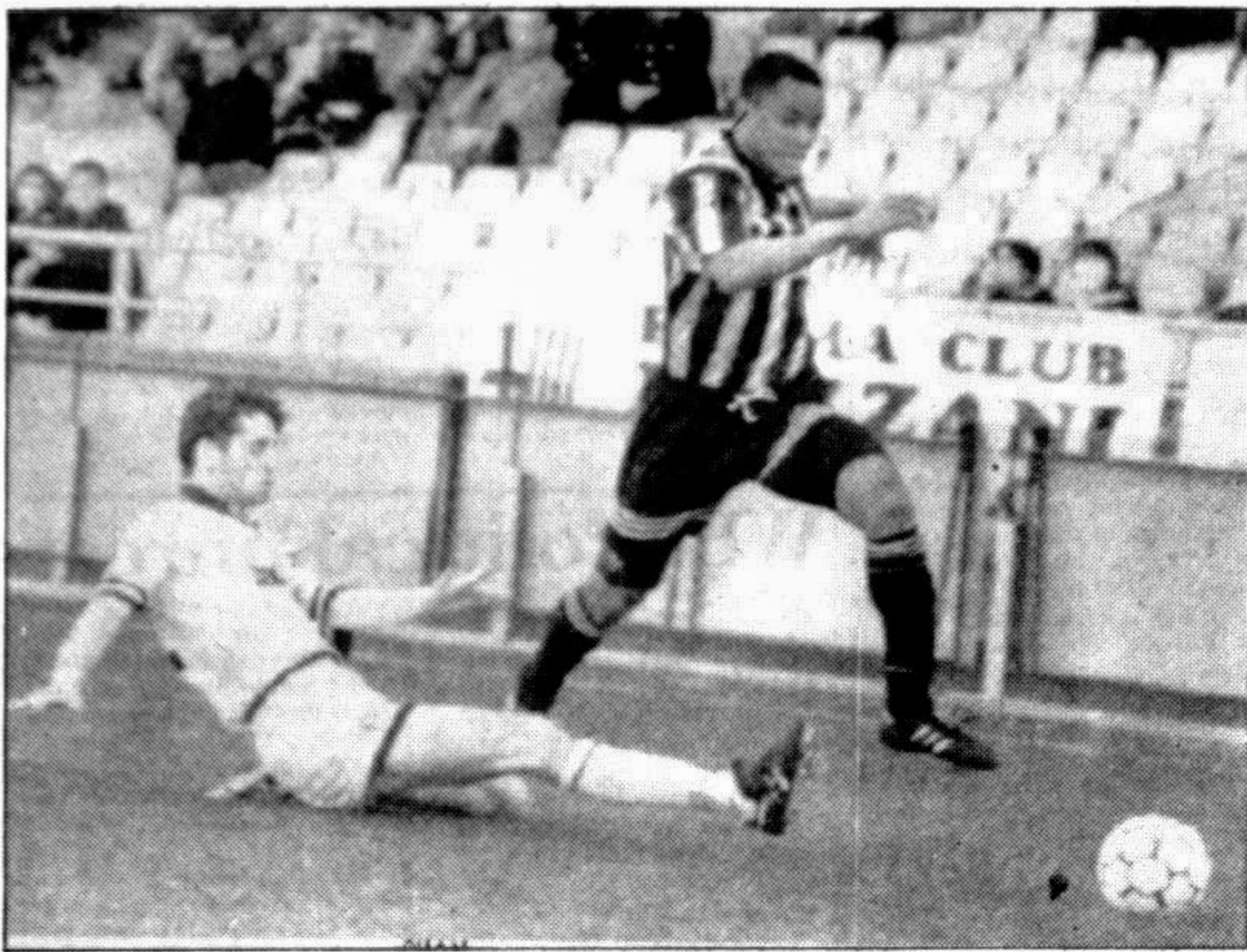
Bayer Leverkusen's Paulo Sergio (R) skips a sliding tackle by Parma captain Lorenzo Minotti during their second leg UEFA Cup semifinal match in Italy on April 18. Parma beat the German club 3-0.