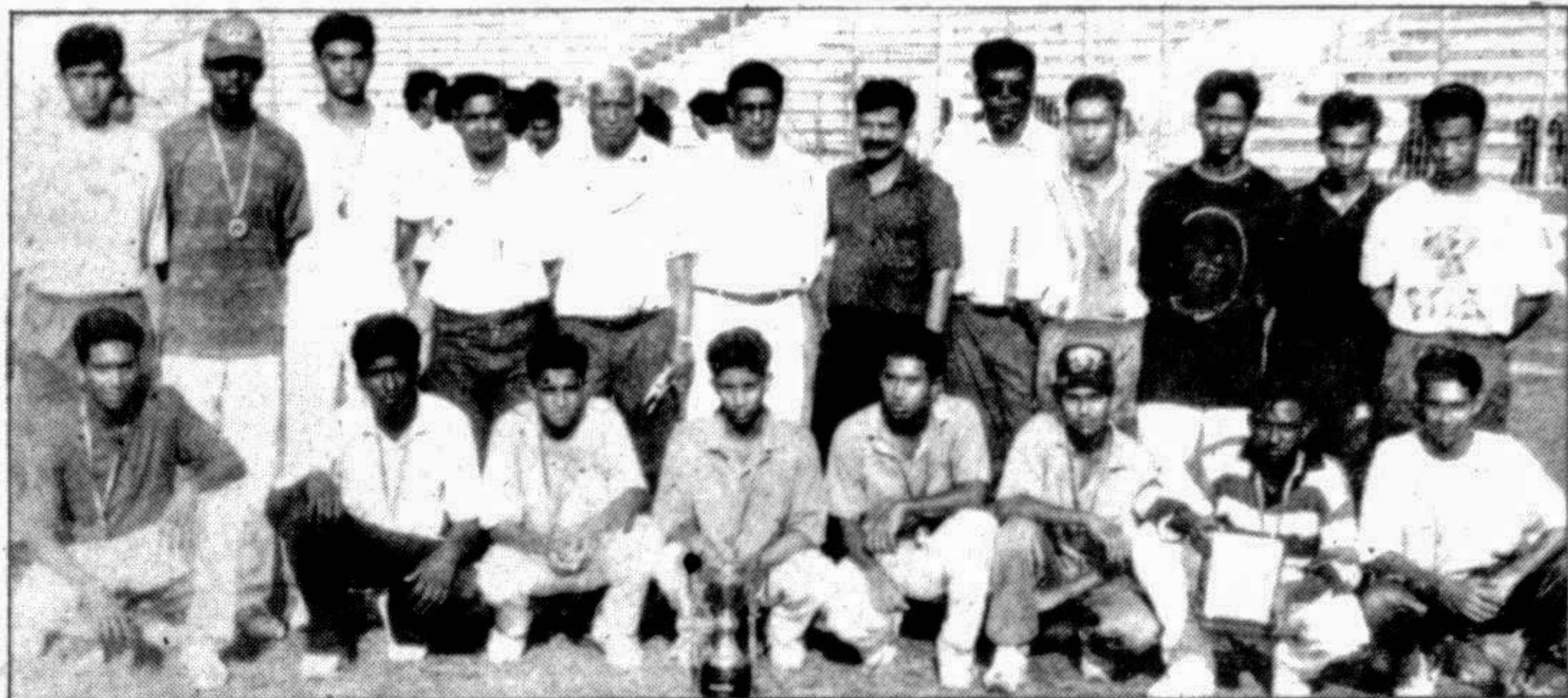
Players and officials of the BKSP cricket team who retained the Beximco national youth championship title for the second successive year beating Dhaka DSA in the final at the Dhaka Stadium yesterday.