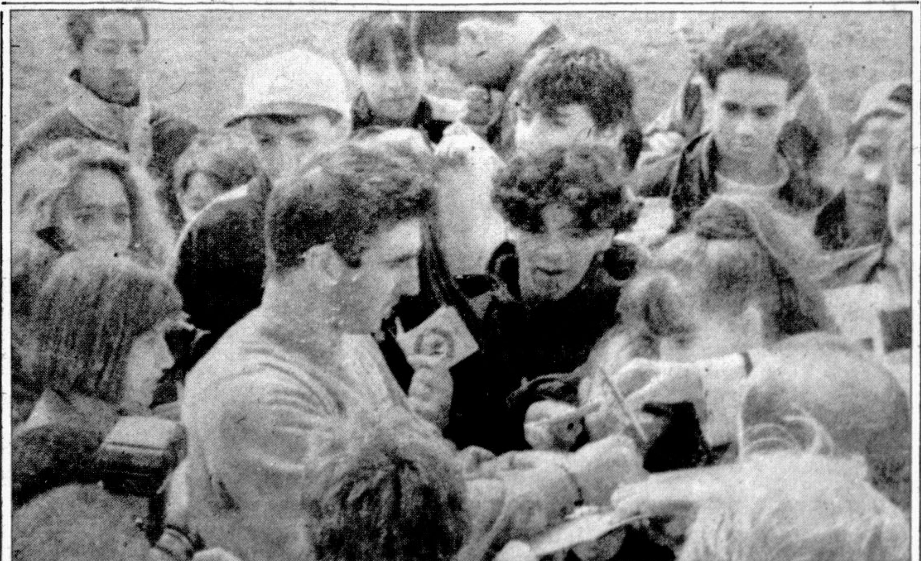
French soccer star Eric Cantona signs autographs for youngsters from Palau XIII, a team from Southwest France, who watched their hero practice with the reserves before starting his first day of community service at Manchester United's training ground on April 18.

The team named today will also play in the Oceania Cup in Auckland, New Zealand, which they must win to automatically qualify for next year's Atlanta Olympics.