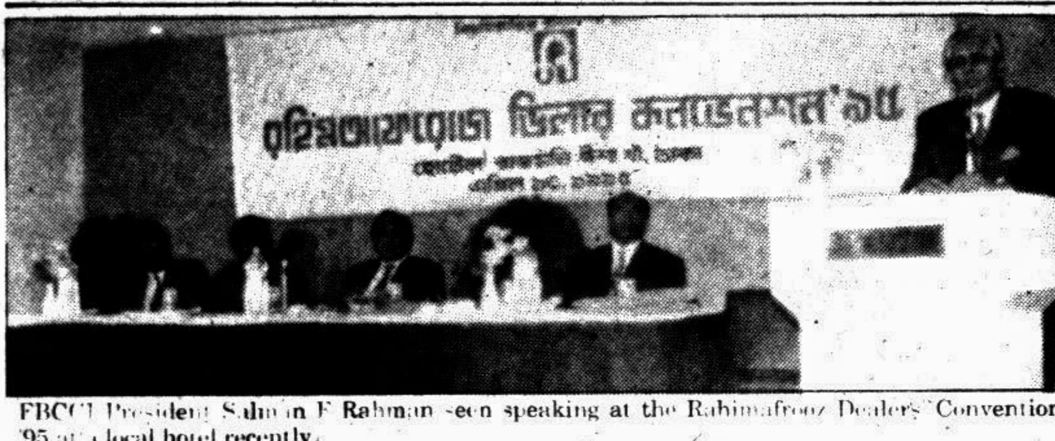
FBCI President Salman F Rahman seen speaking at the Rahimafroz Dealers' Convention '95 at a local hotel recently.