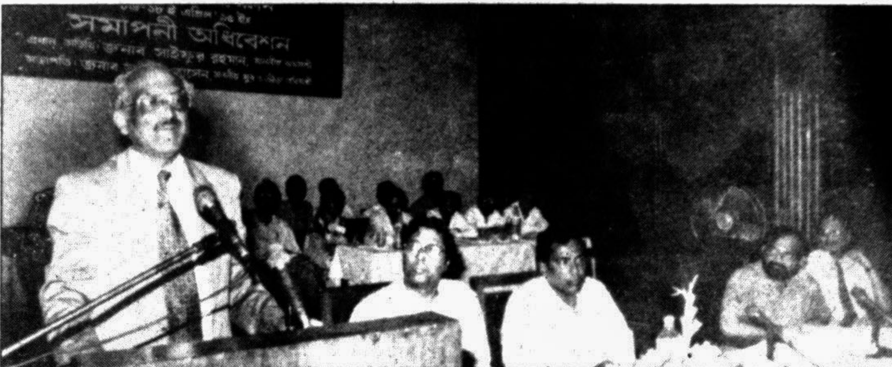
Finance Minister M Saifur Rahman, who was the chief guest on the concluding day of the three-day national workshop on sports policy, deliberating a short but very significant address to the audience at the Engineers Institute yesterday.