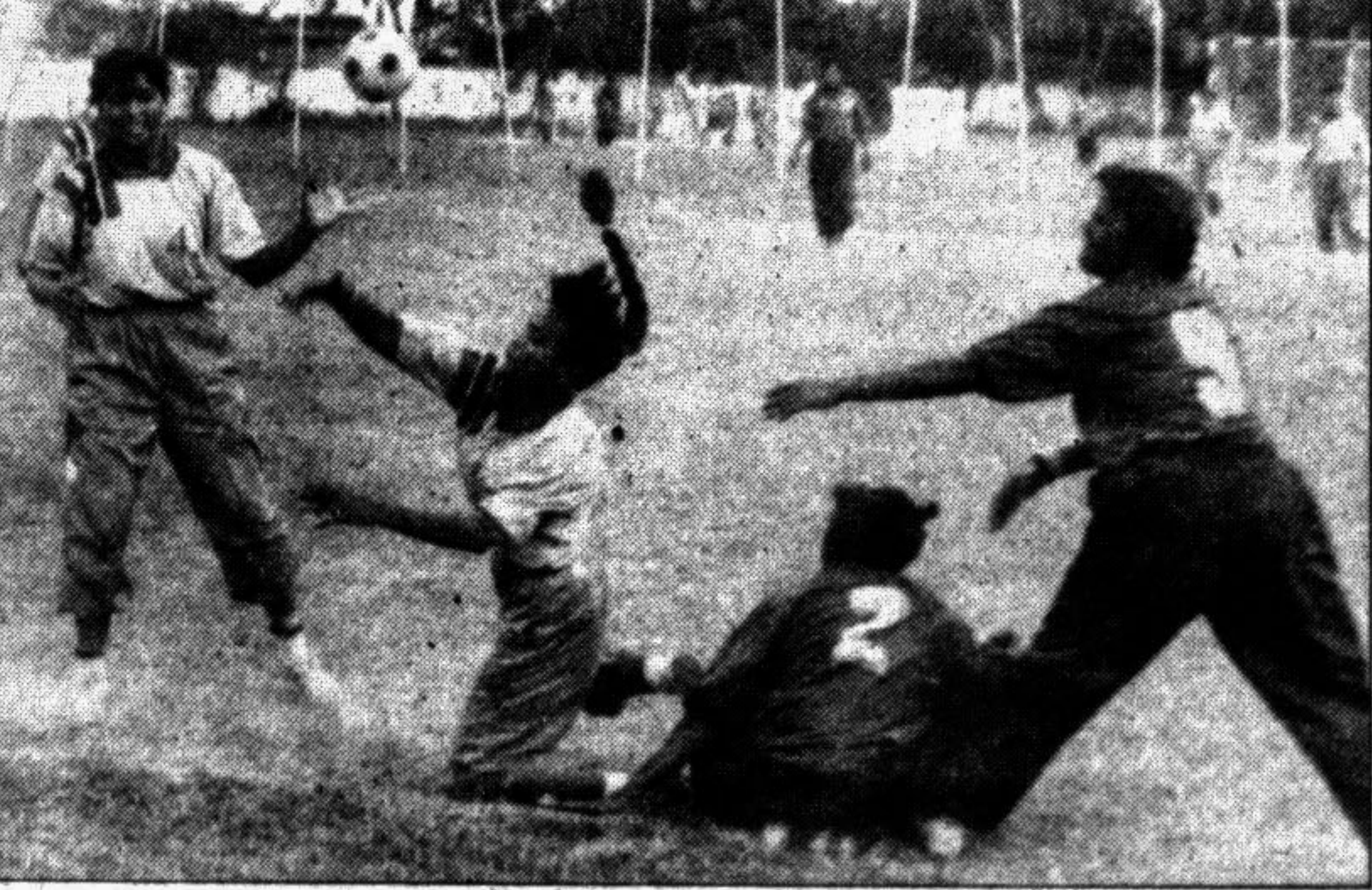
A goalmouth melee during yesterday's Phoenix Insurance national women's handball tournament match between Bangladesh Ansars and Rangpur at the Dhanmondi Women's Sports Complex. Ansars won 19-11.