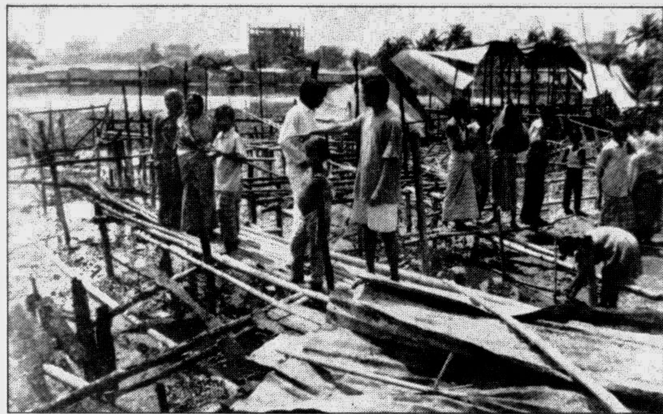
The slum dwellers of Zohura Basti at Mohammadpur survey the remains of the shanties which were gutted in a devastating fire in the early hours of yesterday.

A three-day programme was launched in Mujibnagar yesterday. See Page 12 Col 6