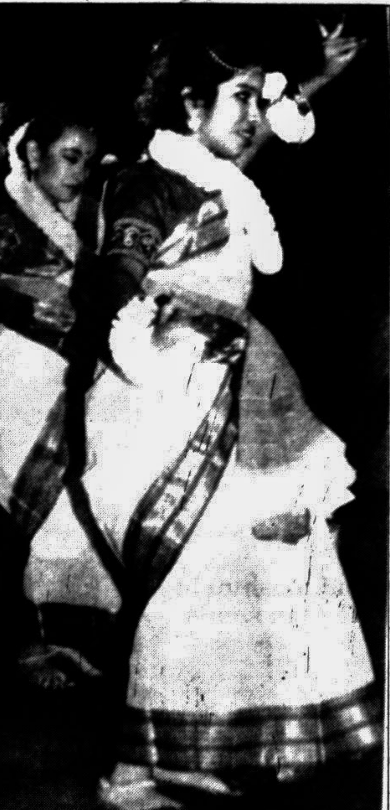
Students of the American School, Dhaka performing a dance at a function on the eve of the Bengali New Year yesterday.