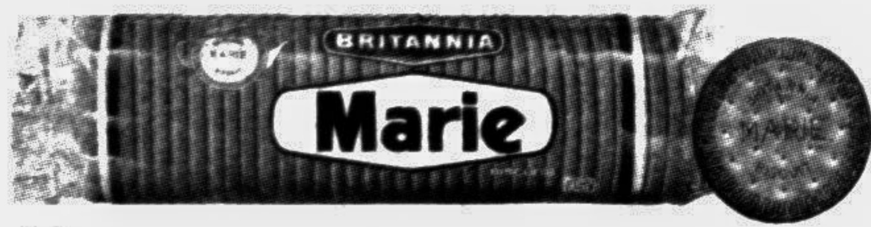
20 TK : 200 gm