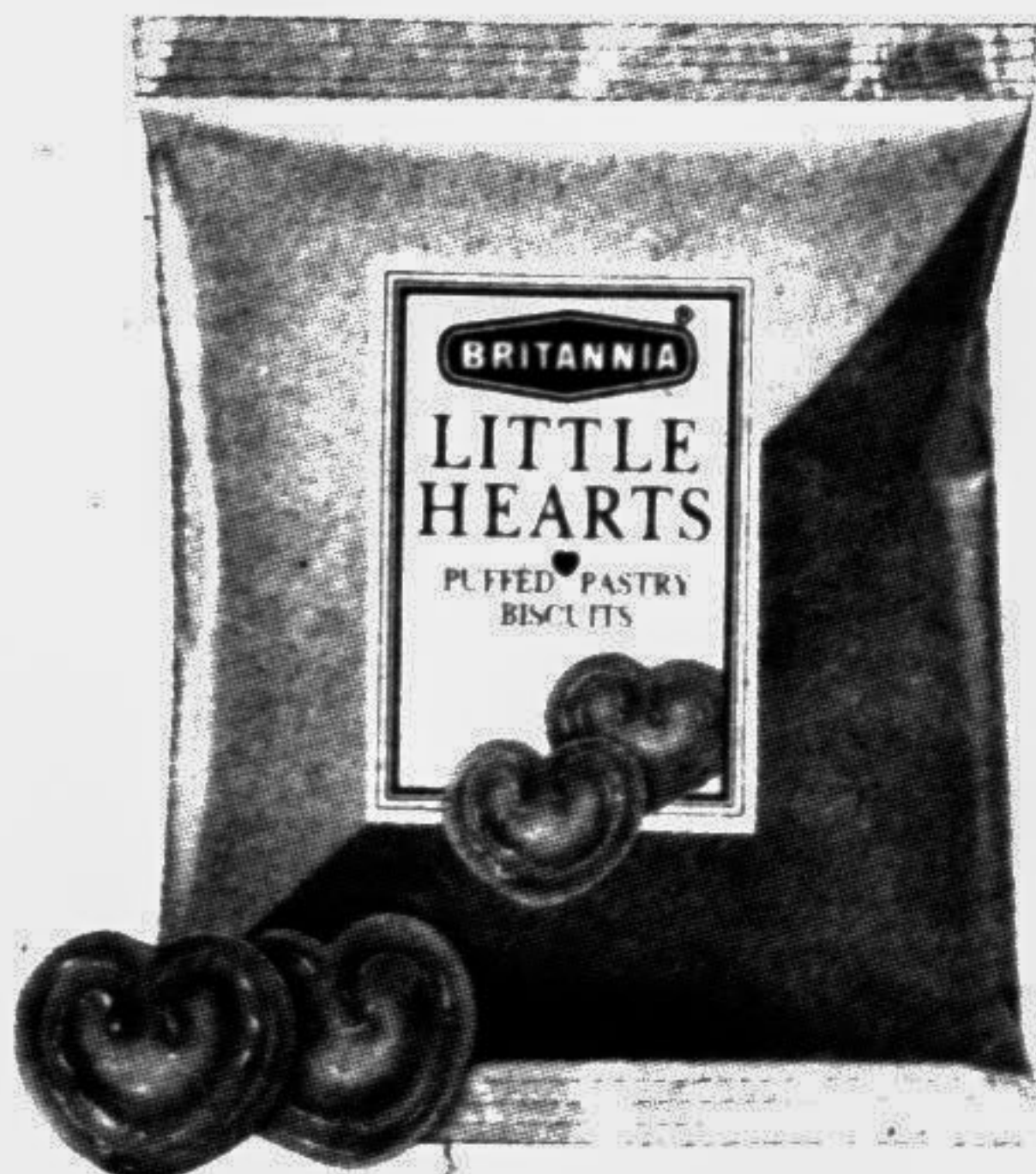
18 TK : 75 gm