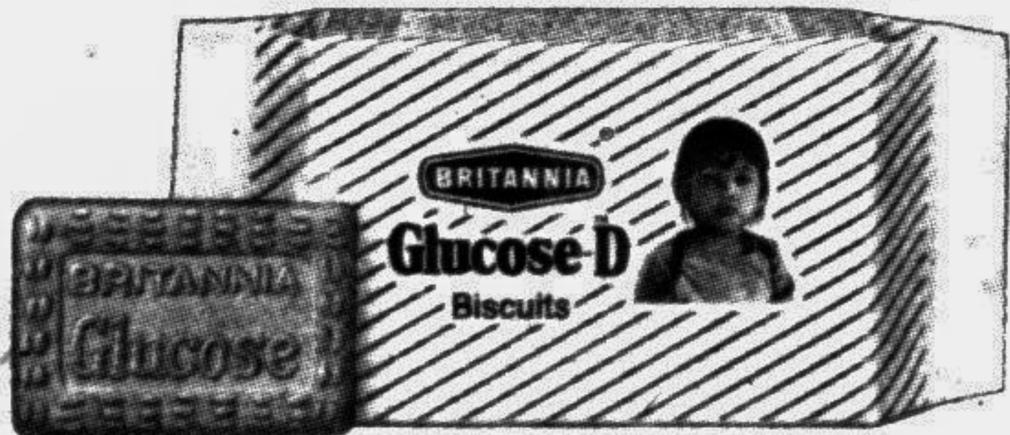
8 TK : 70 gm