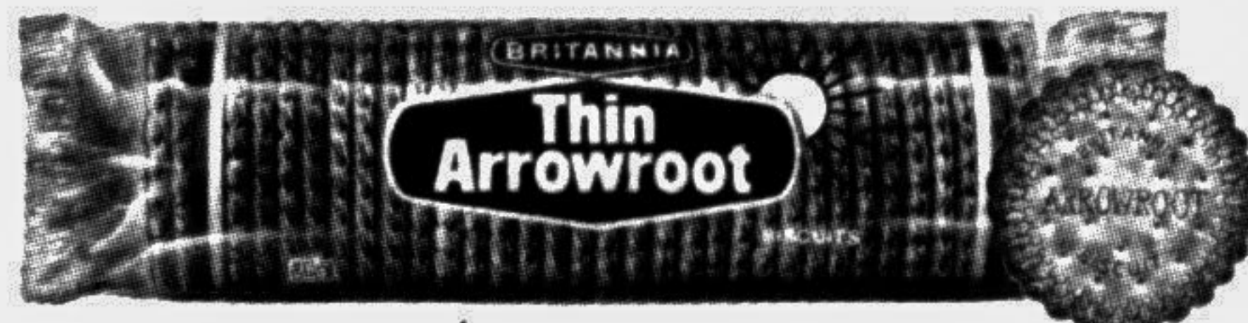
20 TK : 200 gm

Presenting a range of new Britannia Biscuits. Eight delicious reasons to smile. An assortment ranging from the international favourite "Little Hearts" to the tea-time favourite "Marie". They are all now in Bangladesh. Brought to you by the world's leading makers of biscuits.