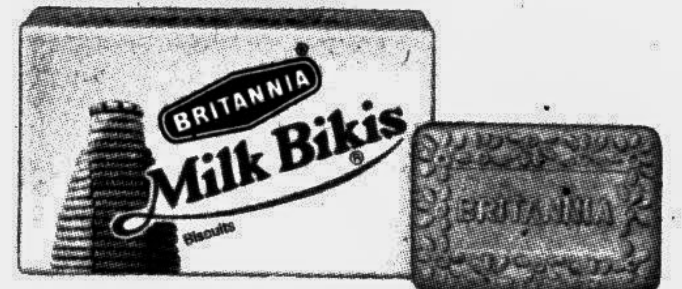
10 TK : 100 gm