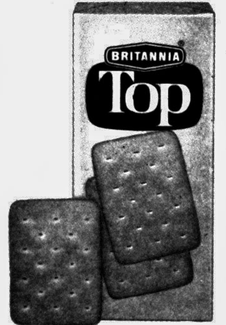
30 TK : 150 gm