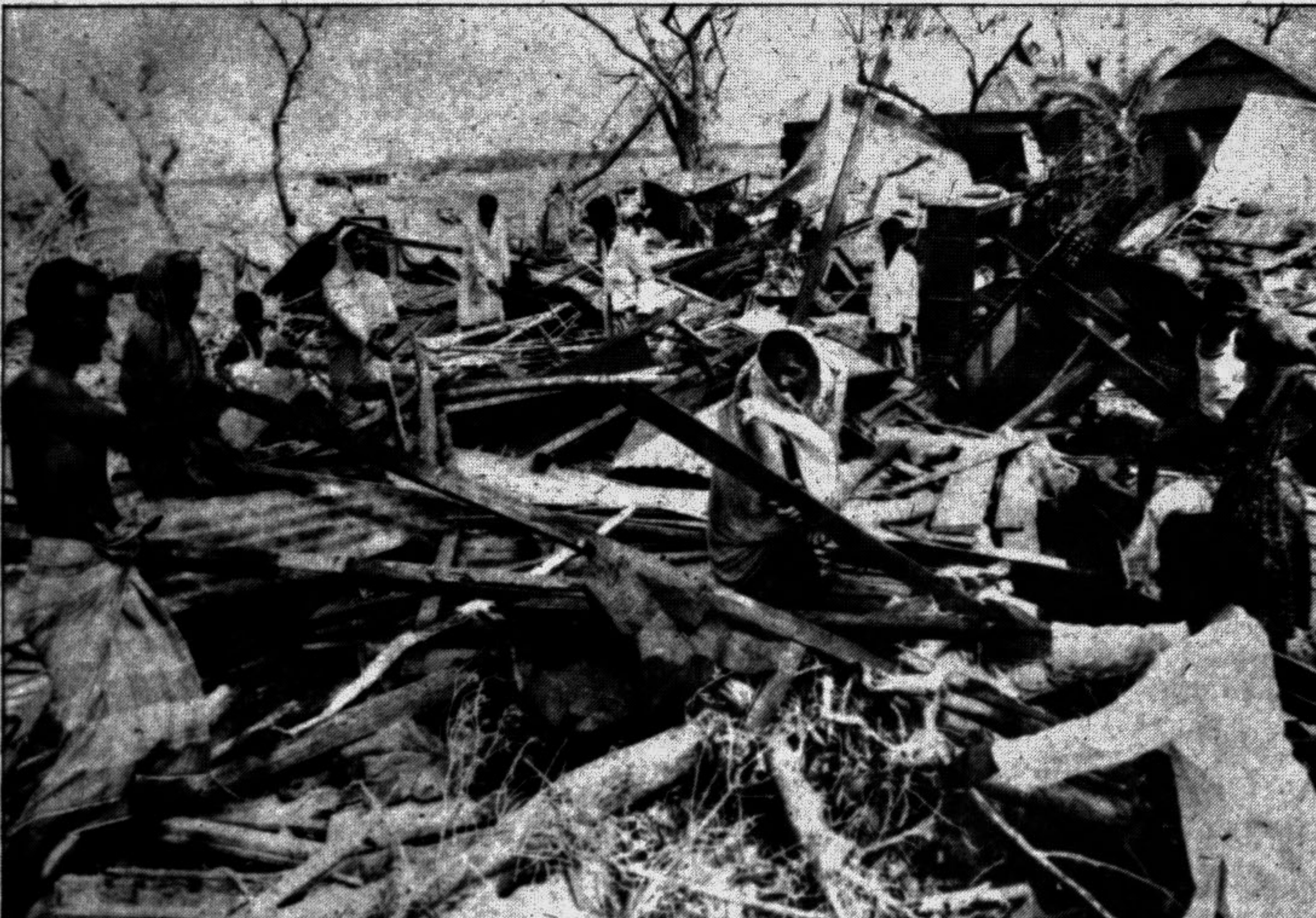
Partial view of an affected area in Gaondia