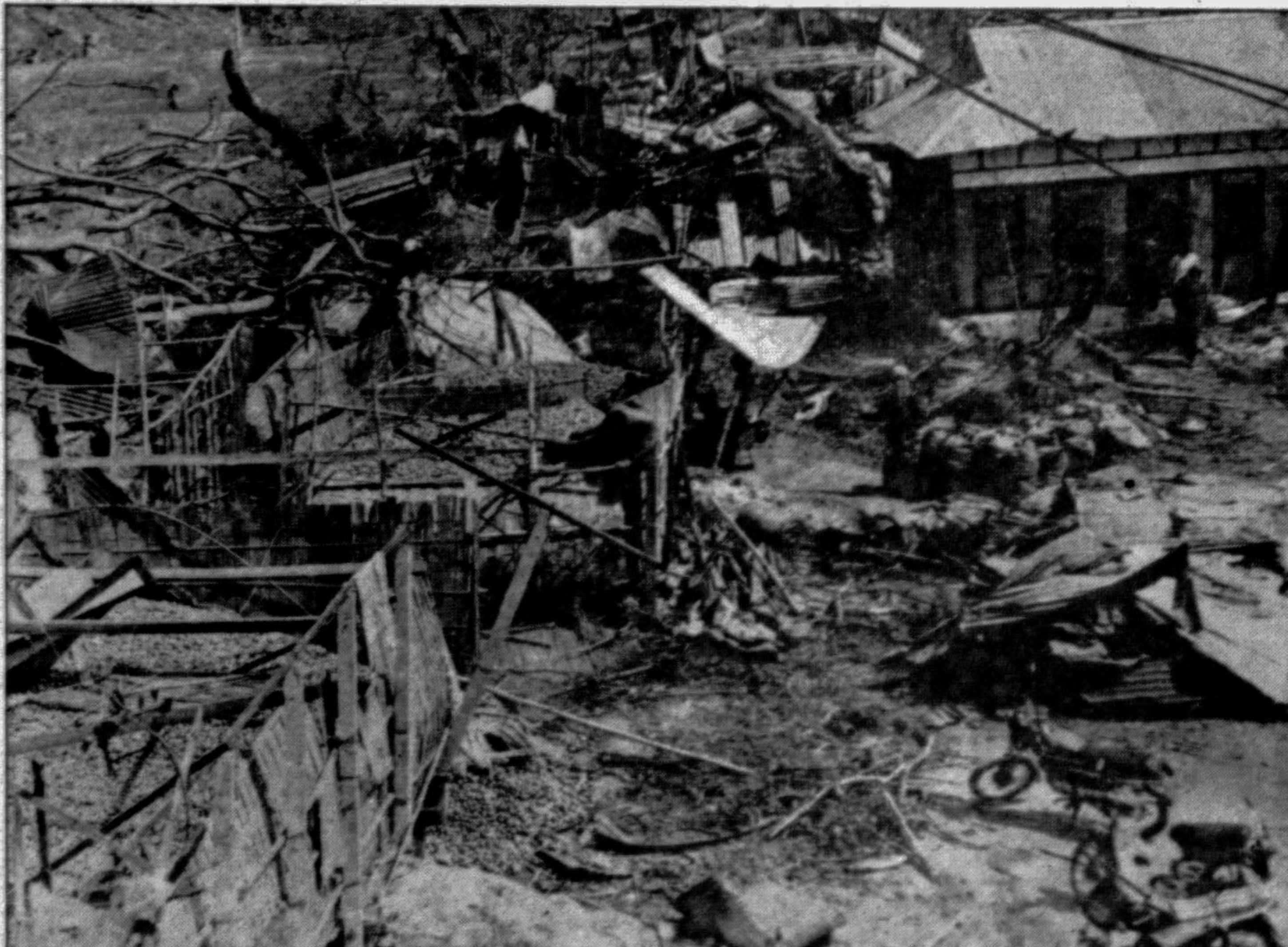
The picture shows how the tornado in Paise village crushed houses on its way.

The affected people are facing another major problem — drinking water crisis. Most of the tubewells were uprooted so an acute crisis of drinking water exists. It is feared that diarrhoea and other similar diseases may spread due to this water crisis.