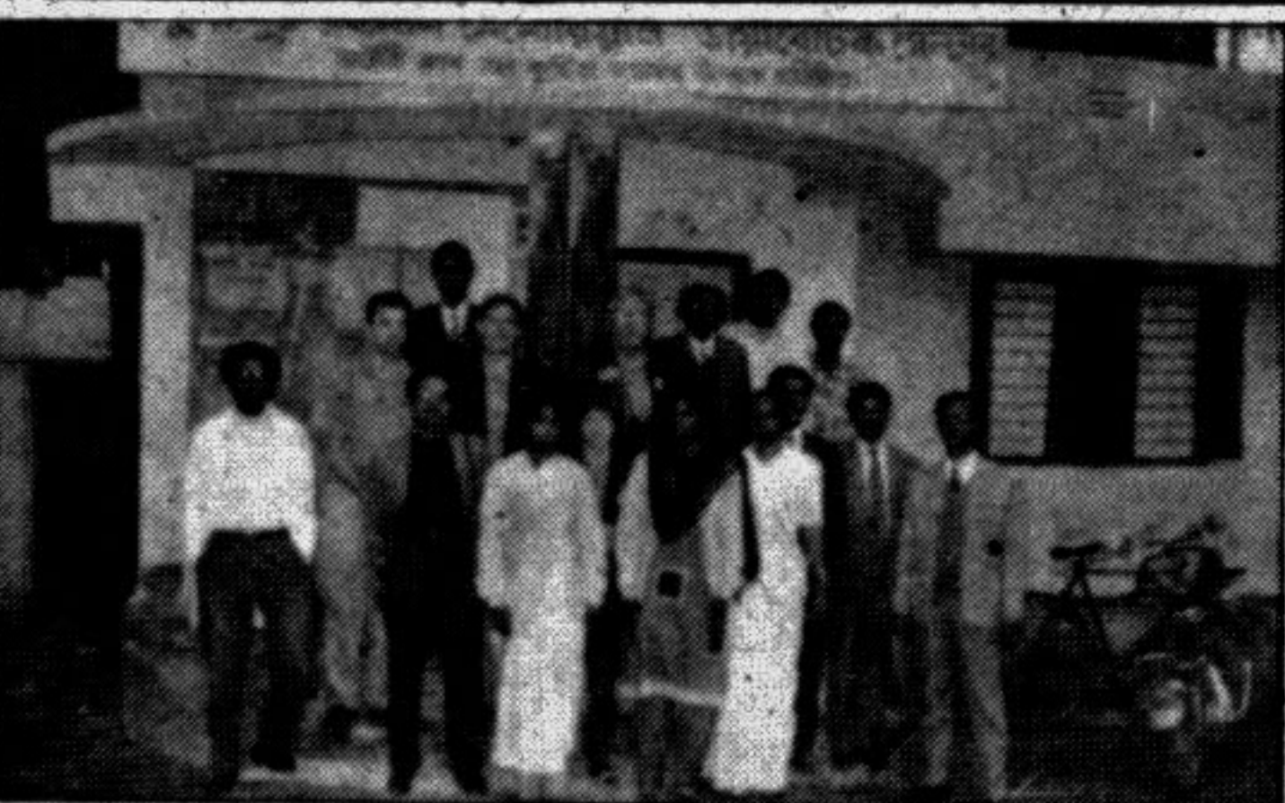
KUSHTIA: Group Study Exchange Team of Rotary International from USA recently visited Diabetic Centre of Kushtia sponsored by RC of Kushtia West as Permanent Community Service Project. Visiting team along with staff and Rotarians are seen in the picture.