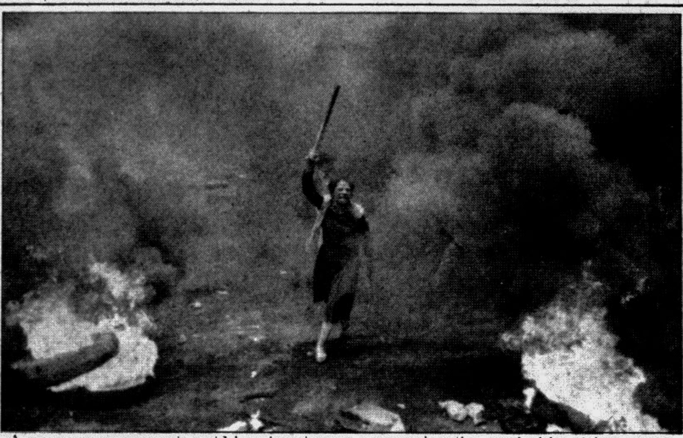
A woman waves a stick amid burning tires as a general strike, marked by violent street demonstrations against government economic policy, brought the resignation of Lebanese Prime Minister Omar Karame and his cabinet on May 6, 1992 after Syria had given its blessing to the formation of a new government. The Lebanese civil war broke out 20 years ago on April 13, 1975.