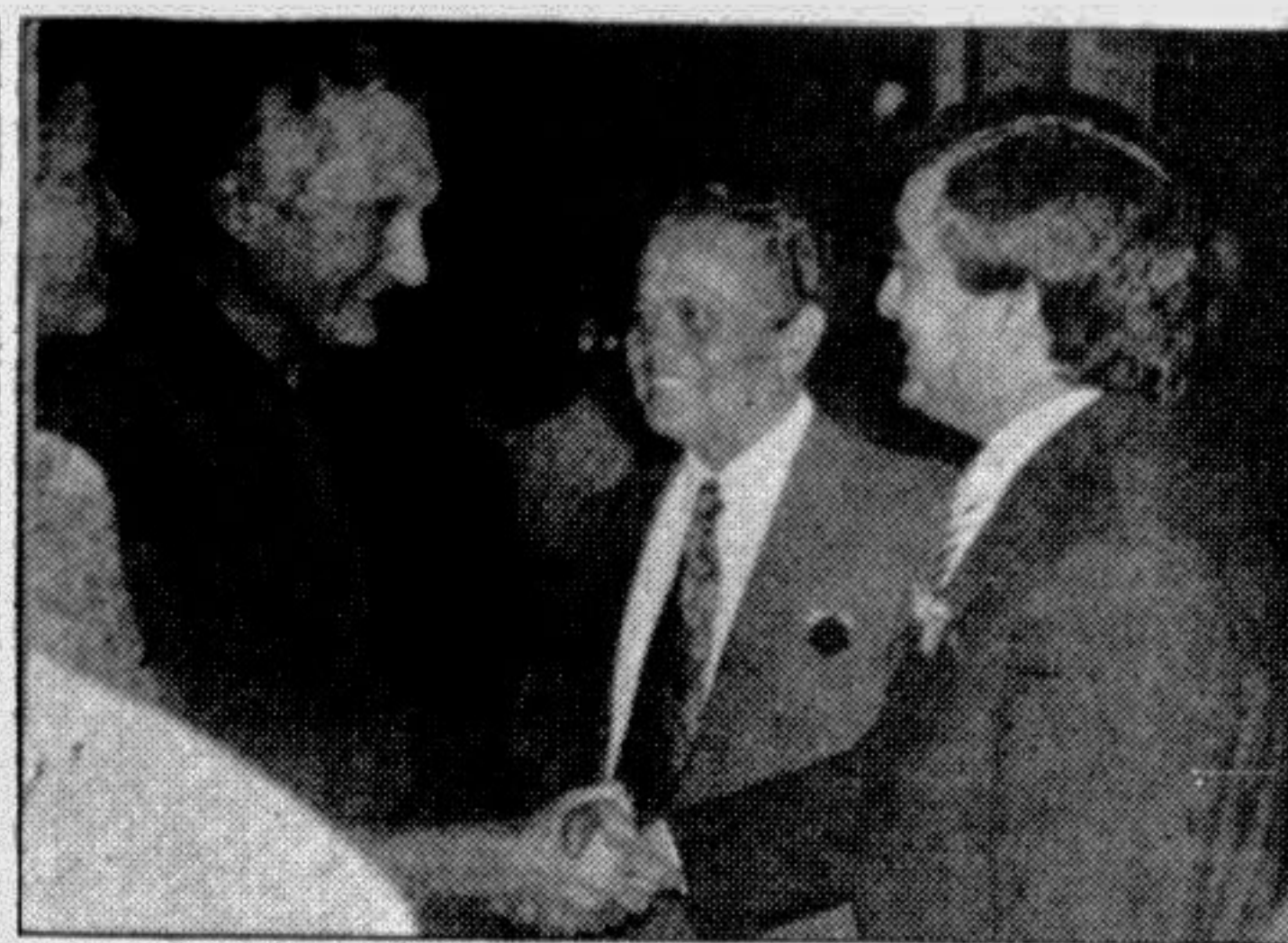
The annual dinner of HRC Syndicate Ltd was held recently at Sonargaon Hotel to mark the fourth founding anniversary celebration of the group.