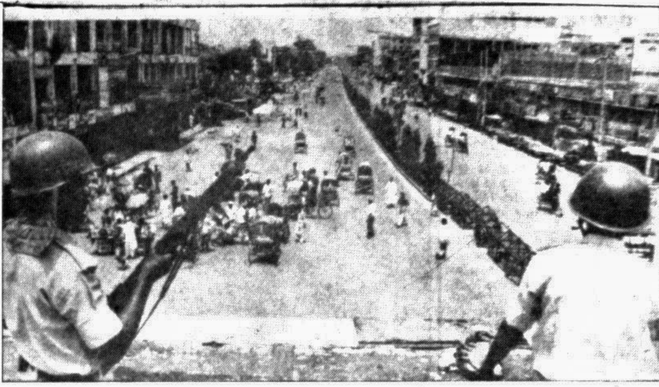
The city's New Market area during hartal hours yesterday.

A spokesman for the SRG team said the elections were by and large free and fair though there was minor mismanagement.