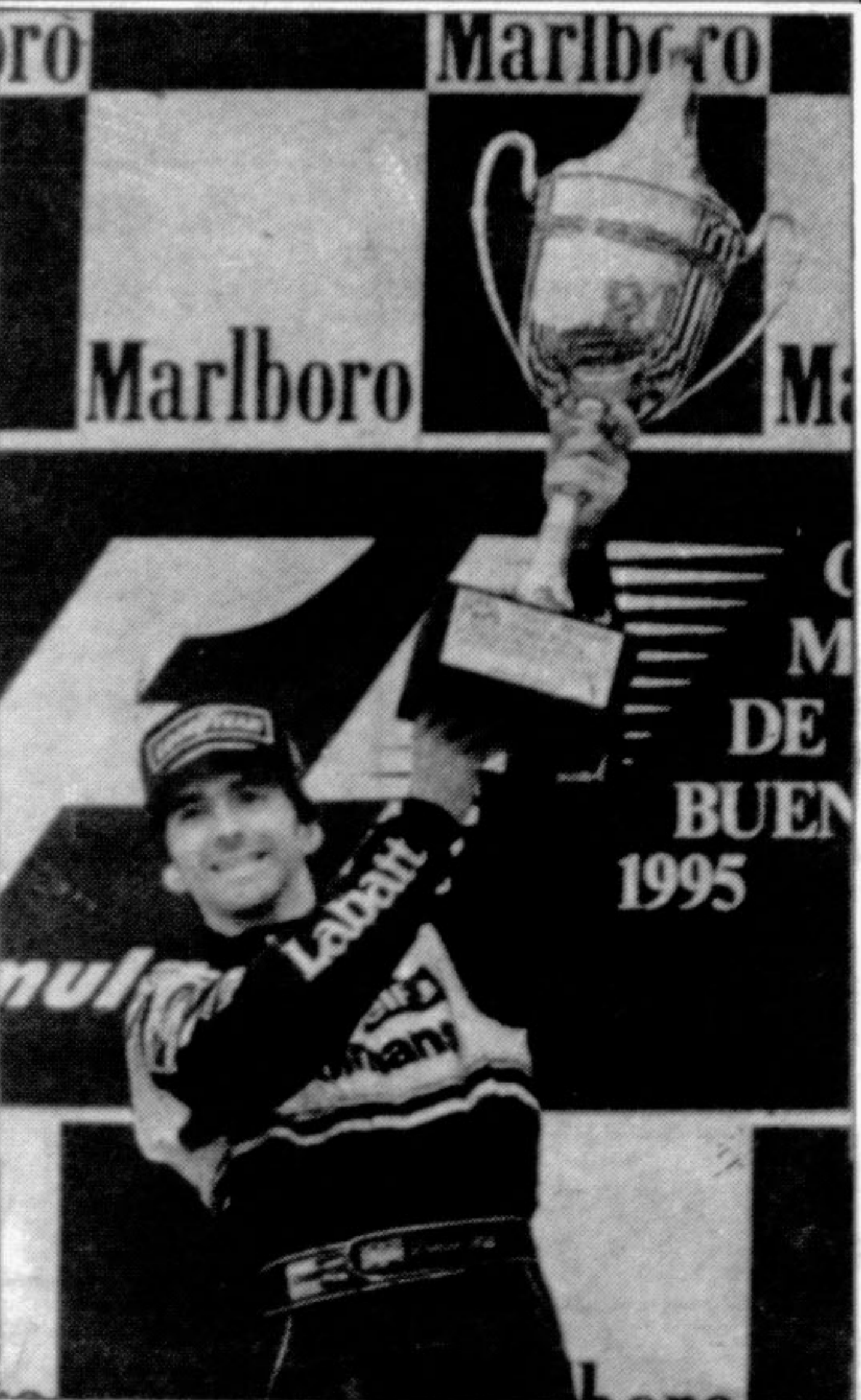
British Formula One driver Damon Hill holds the trophy on the winner's podium at the Oscar Galvez circuit in Buenos Aires after winning the Argentine Grand Prix on April 9.

"We see China as an emerging sports power," he said.