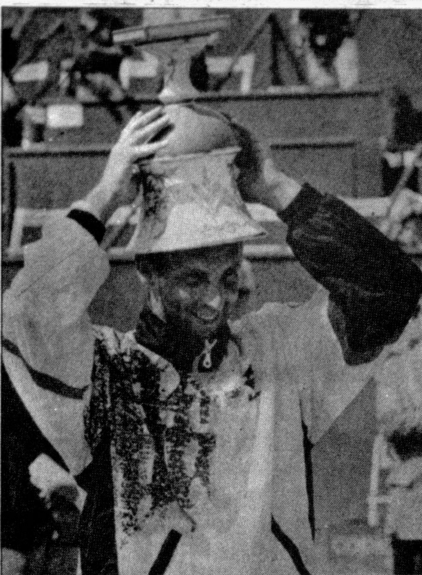
Austrian Thomas Muster has a bit fun with the trophy after winning the Estoril Open in Lisbon on April 9. Muster beat Spaniard Alberto Costa 6-4, 6-2 in the final.

"I haven't made a fortune, but every fighter dreams of becoming a world