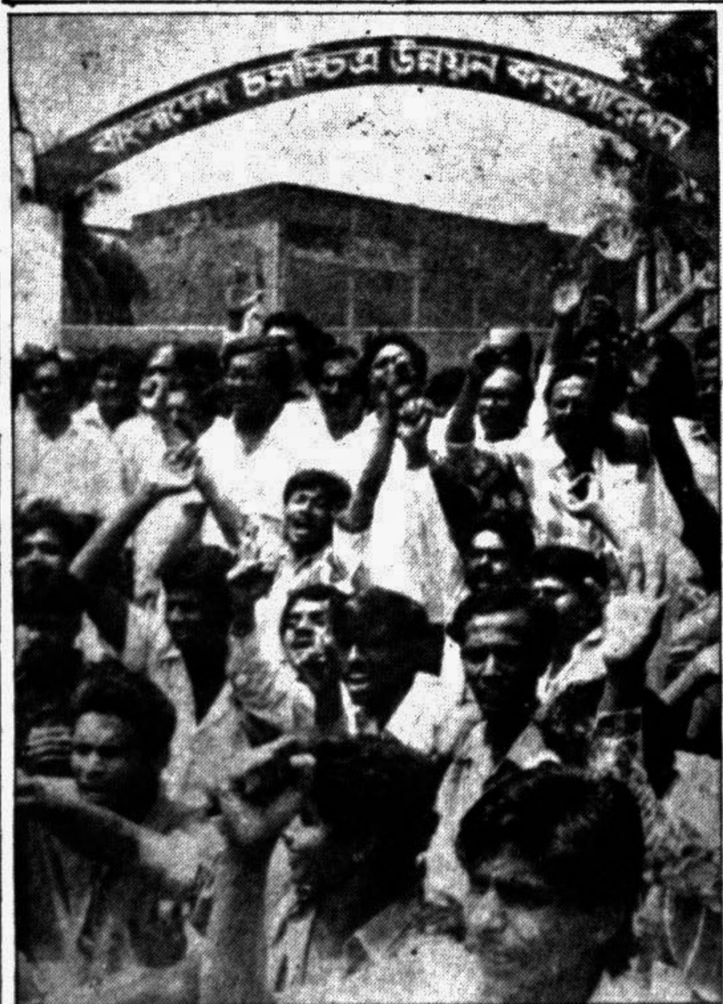
A demonstration was held in front of the main entrance of the Film Development Corporation (FDC) in the city yesterday protesting the last Friday's incident in which three film artists were reportedly harassed by FDC security guards.

Twenty editors from greater Chittagong, Sylhet, Comilla, Noakhali and Chittagong Hill districts are expected to take part in the seminar, said a press release yesterday.