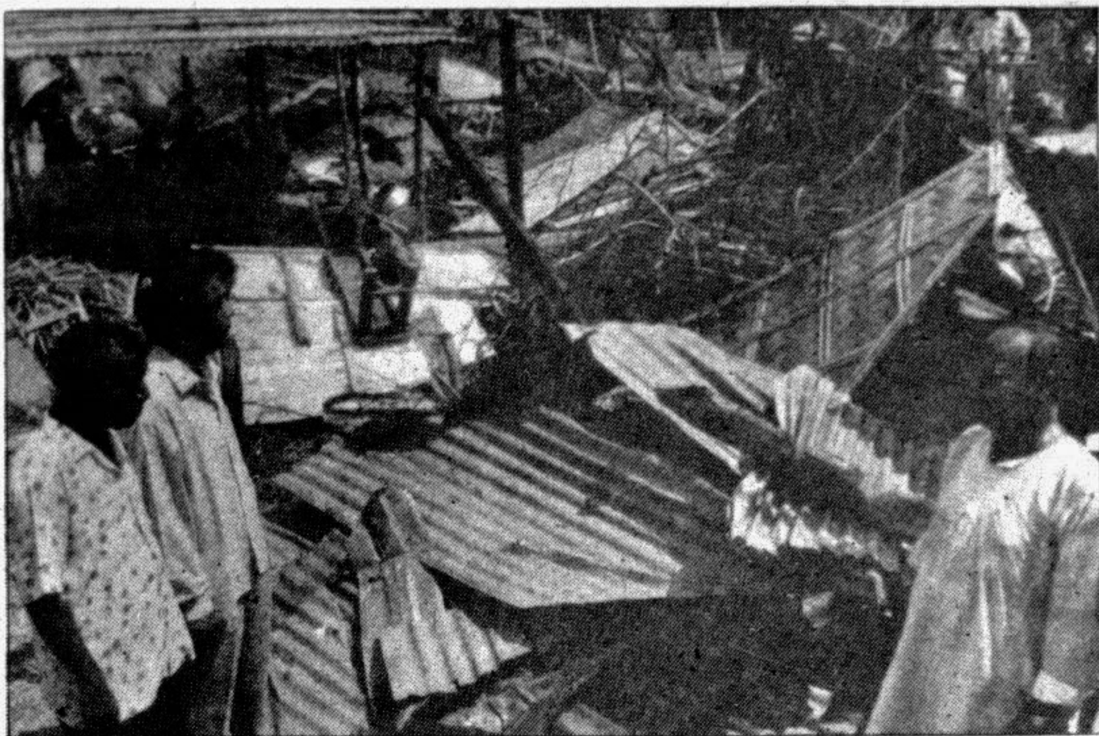
Shamsul Islam, Minister for Commerce and Information, visiting the tornado-hit area at Louhajang under Munshiganj district yesterday.

Biswas conveyed his deep sympathy to the members of the bereaved families and prayed for the salvation of the departed souls. He also wished early recovery of the injured now under treatment in different hospitals.