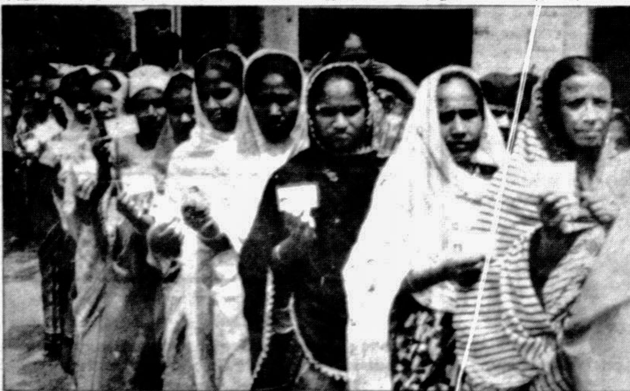
Women voters queuing up at a polling centre in Tongi yesterday show their identity cards.