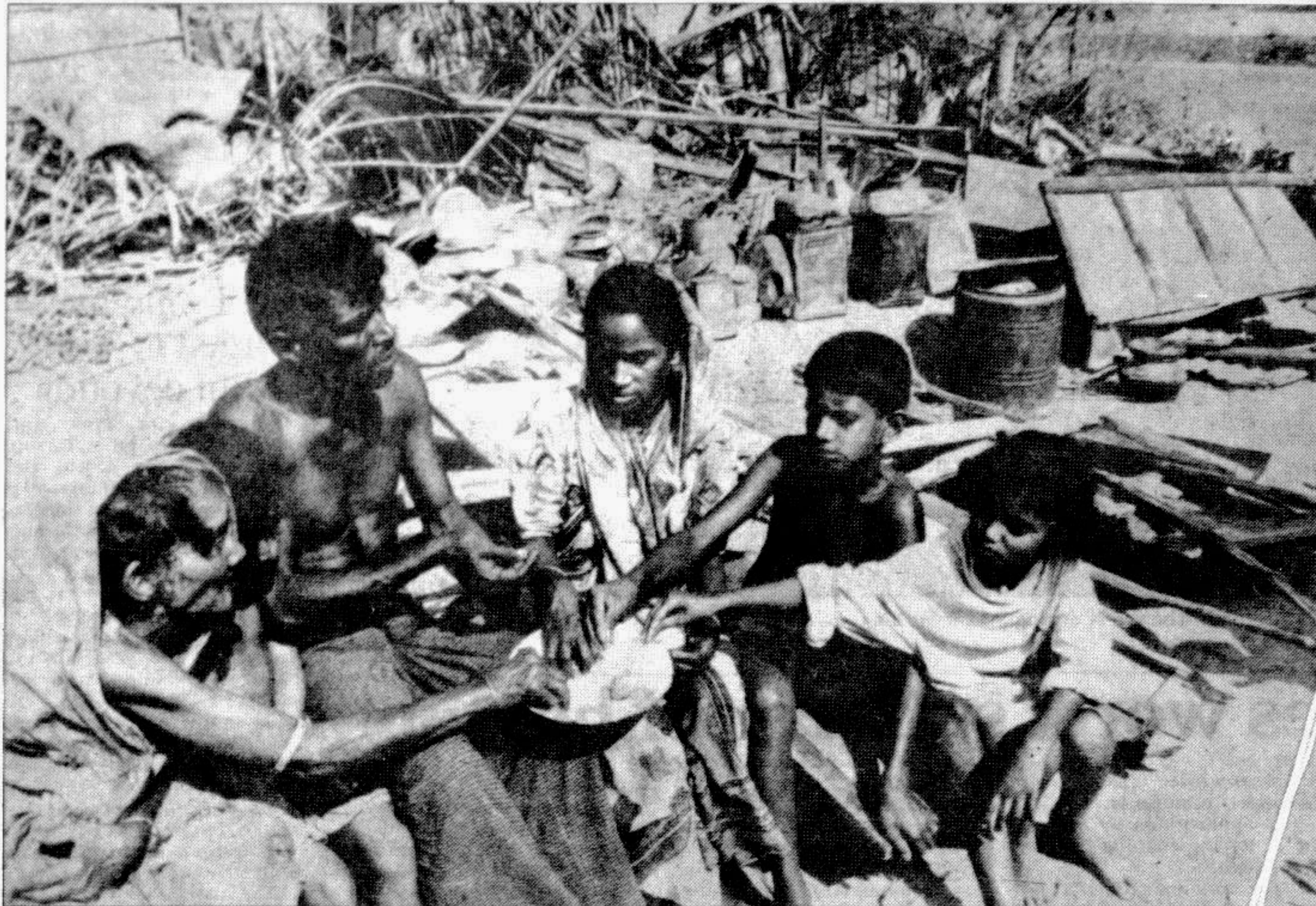
A family ruined by Saturday's tornado at village Paissa in Louhajang thana of Munshiganj district taking food after two days. Official relief was yet to reach the village yesterday.

LUCKNOW: Apr 10: Melody queen Lata Mangeshkar was honoured with 'Awadh Ratna' and 'Sahu Sur Samman' awards at a function here today. The Uttar Pradesh governor Motilal Vora presented the awards, reports PTI.