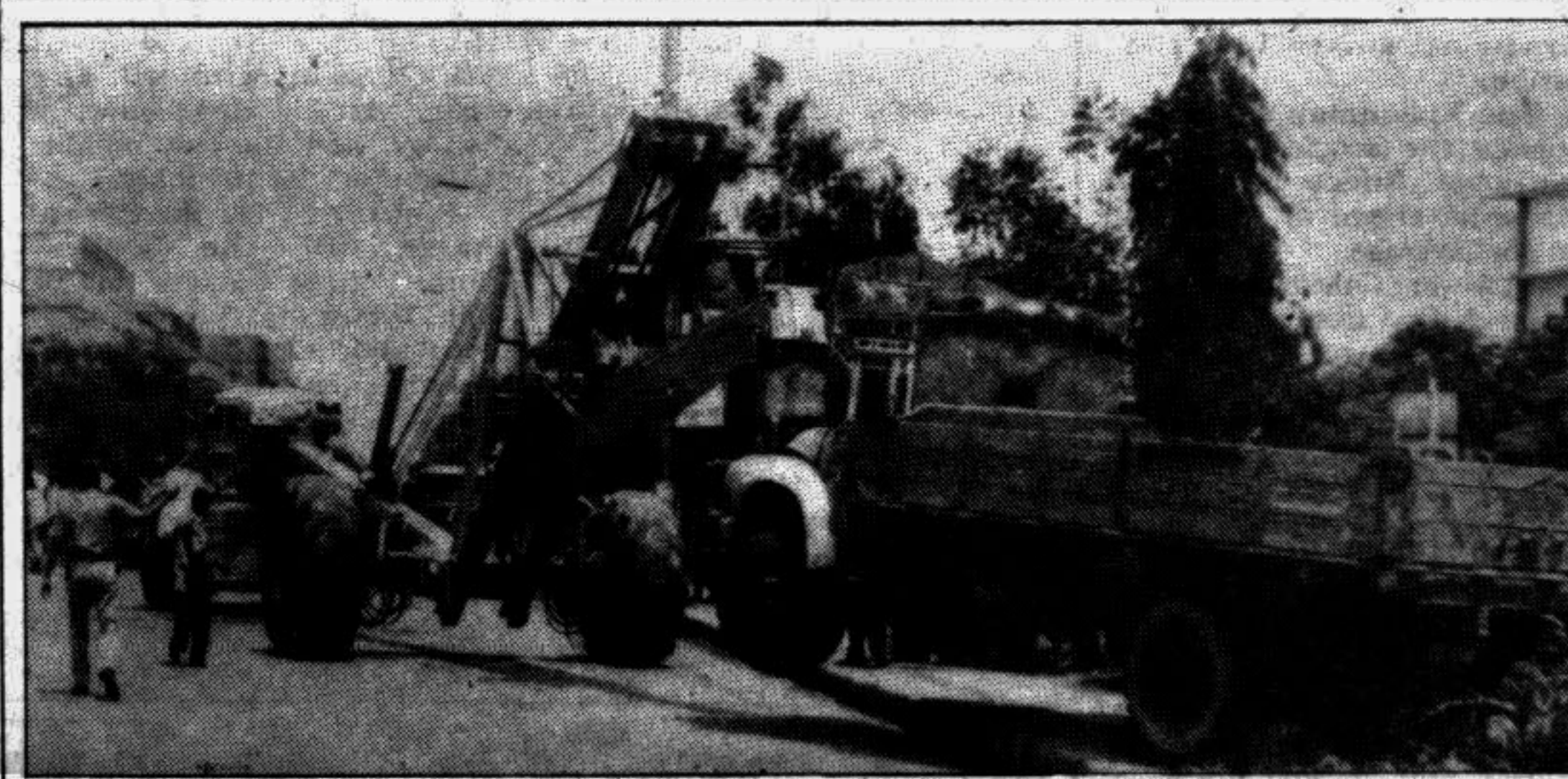
A truck rammed into a park on Airport Road in the city yesterday.

By DMCH Correspondent A baby girl succumbed to her injuries at the PG hospital in the city yesterday. Lipi, 2, daughter of Lutfur Rahman, was seriously injured when a roof tile of an apartment of the century Tower at Elephant road, Maghbar, fell on her at around 9 am. The baby was immediately taken to the hospital where she expired two hours later.