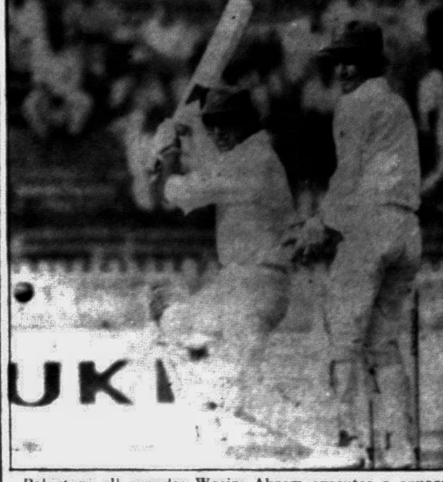
Pakistan all rounder Wasim Akram executes a square drive while Bangladesh wicketkeeper Khaled Masud looks on during their Asia Cup limited overs match at the Sharjah Stadium in the UAE on April 8. Akram was later declared man-of-the-match for his knock of 30 not out and two wickets for 25.