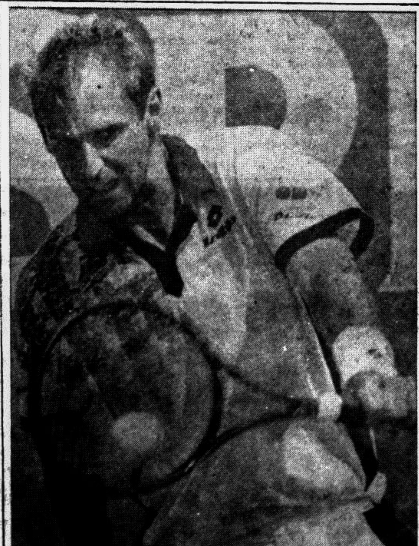
Austrian Thomas Muster plays a backhand return against Spaniard Emilio Sanchez during their semifinal match of the Estoril Open tennis tournament in Lisbon on Saturday. Muster won 6-2, 6-4.