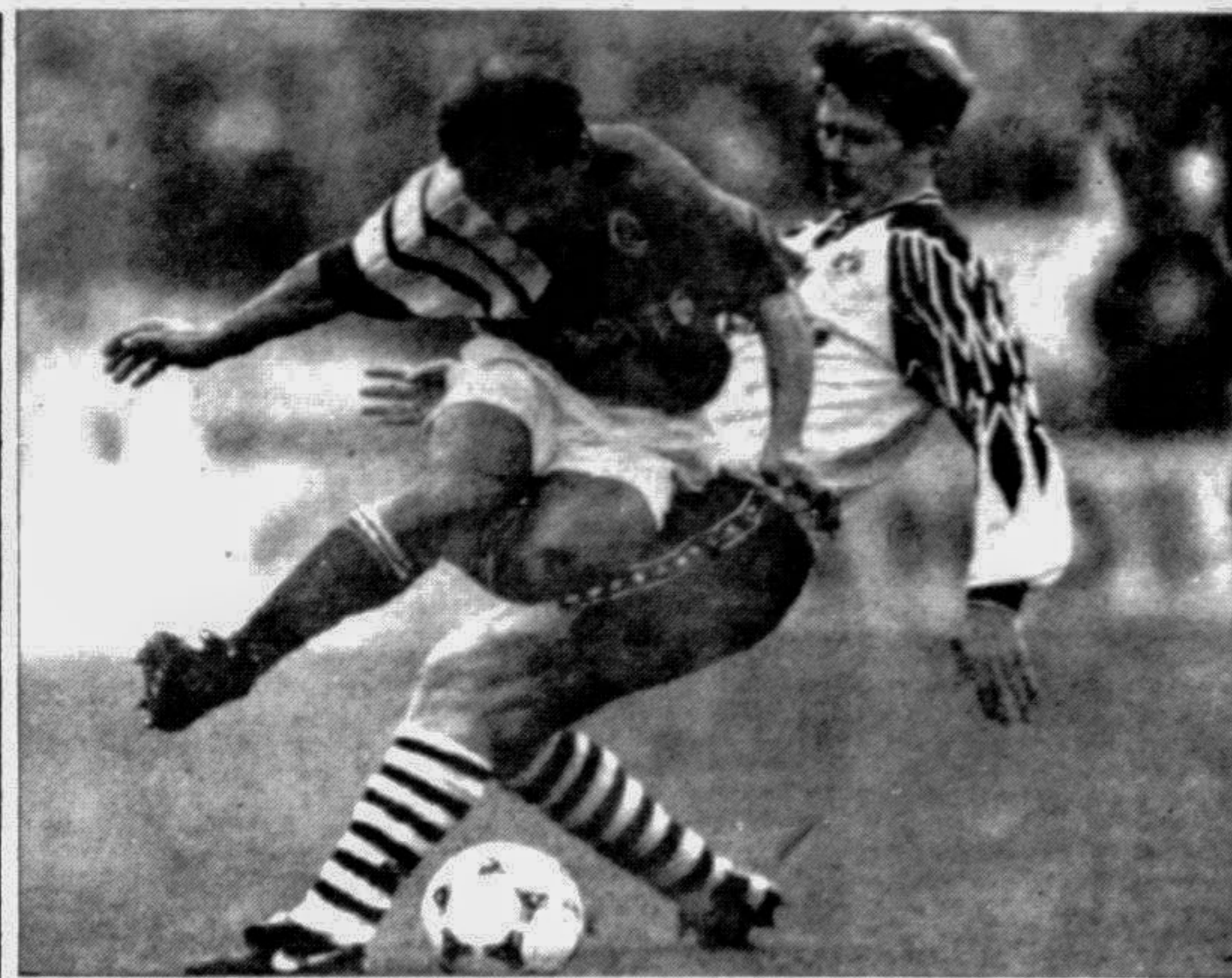
Olaf Thon (L) of Werder Bremen jumps over Borussia Dortmund's Stefan Reuter (R) during their Bundesliga match at the Park Stadium in Bonn on Apr 8. The match ended in a goalless draw.