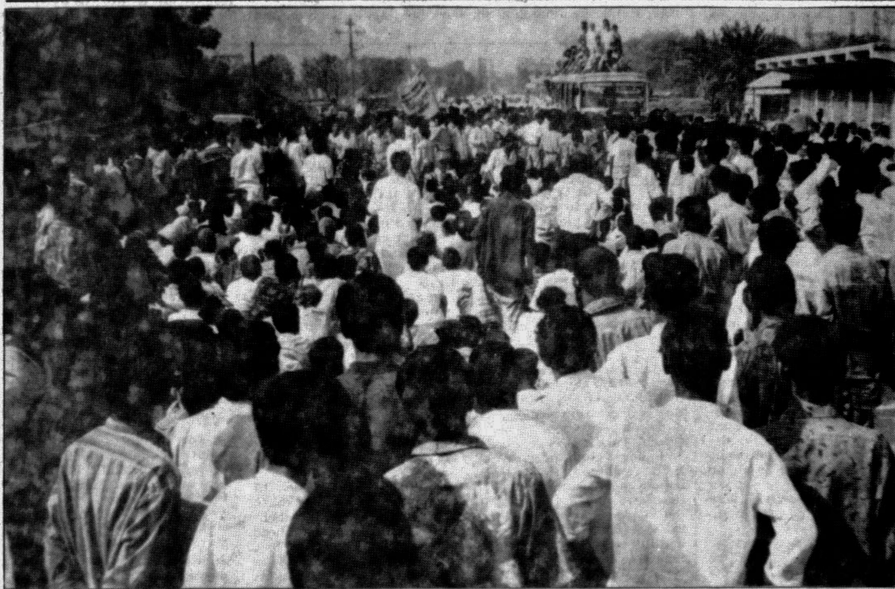
RANGPUR: A huge mob is seen laying a human barricade at Mithapukur in the Rangpur-Dhaka national highway recently in demand of supply of fertilizers.

A good number of deep tubewells, power pumps and shallow tubewells have reportedly been lying unused and gone out of order due to negligence of the concerned authorities.