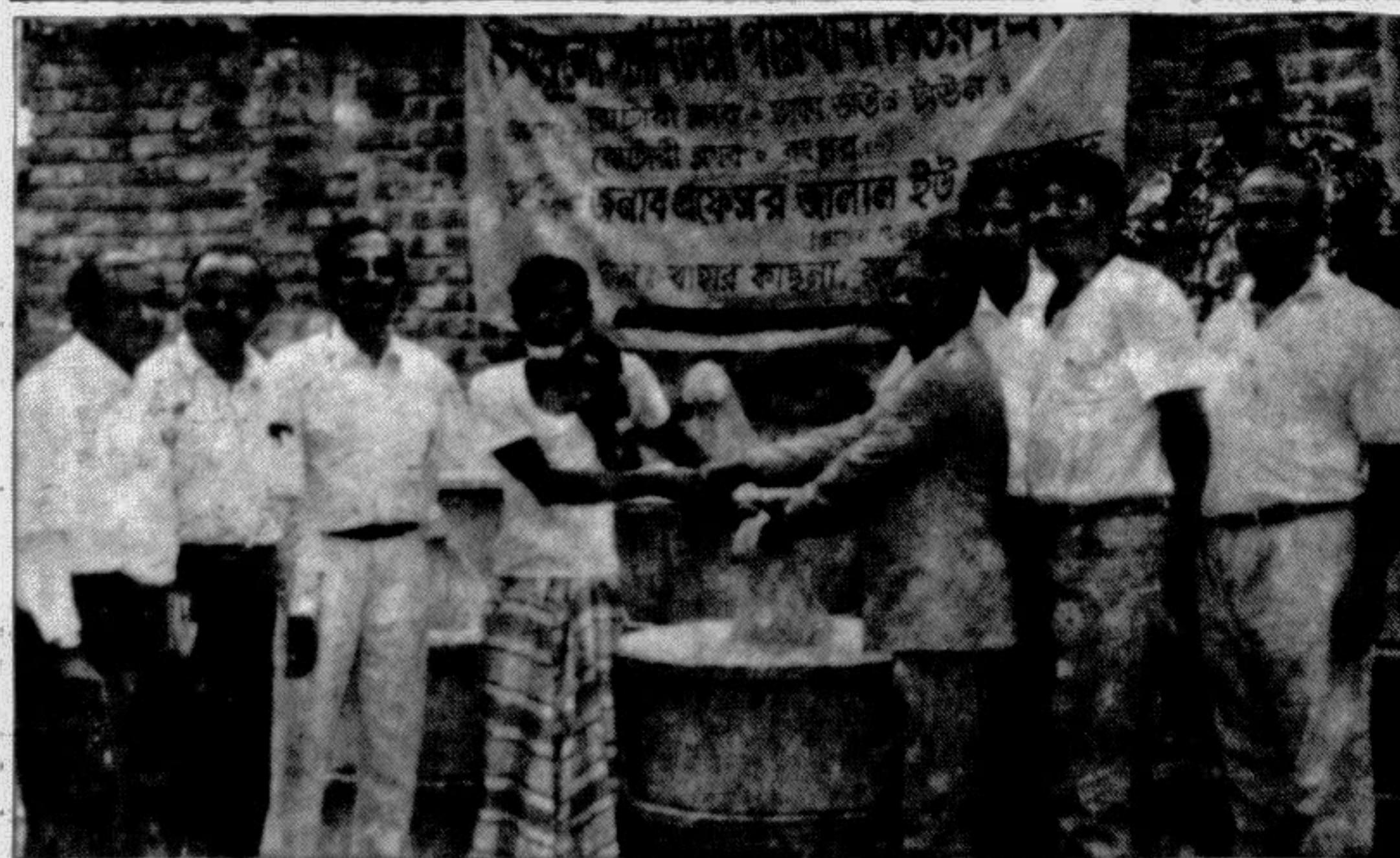
RANGPUR: The executive members of the Dhaka down town Rotary Club are seen distributing some 22 sets of sanitary latrines among the poor people at free of cost at Bahar Katchna in Rangpur sadar thana area recently, in a bid to help improve the village sanitation in the area.

A case was lodged with the police but none was arrested so far.