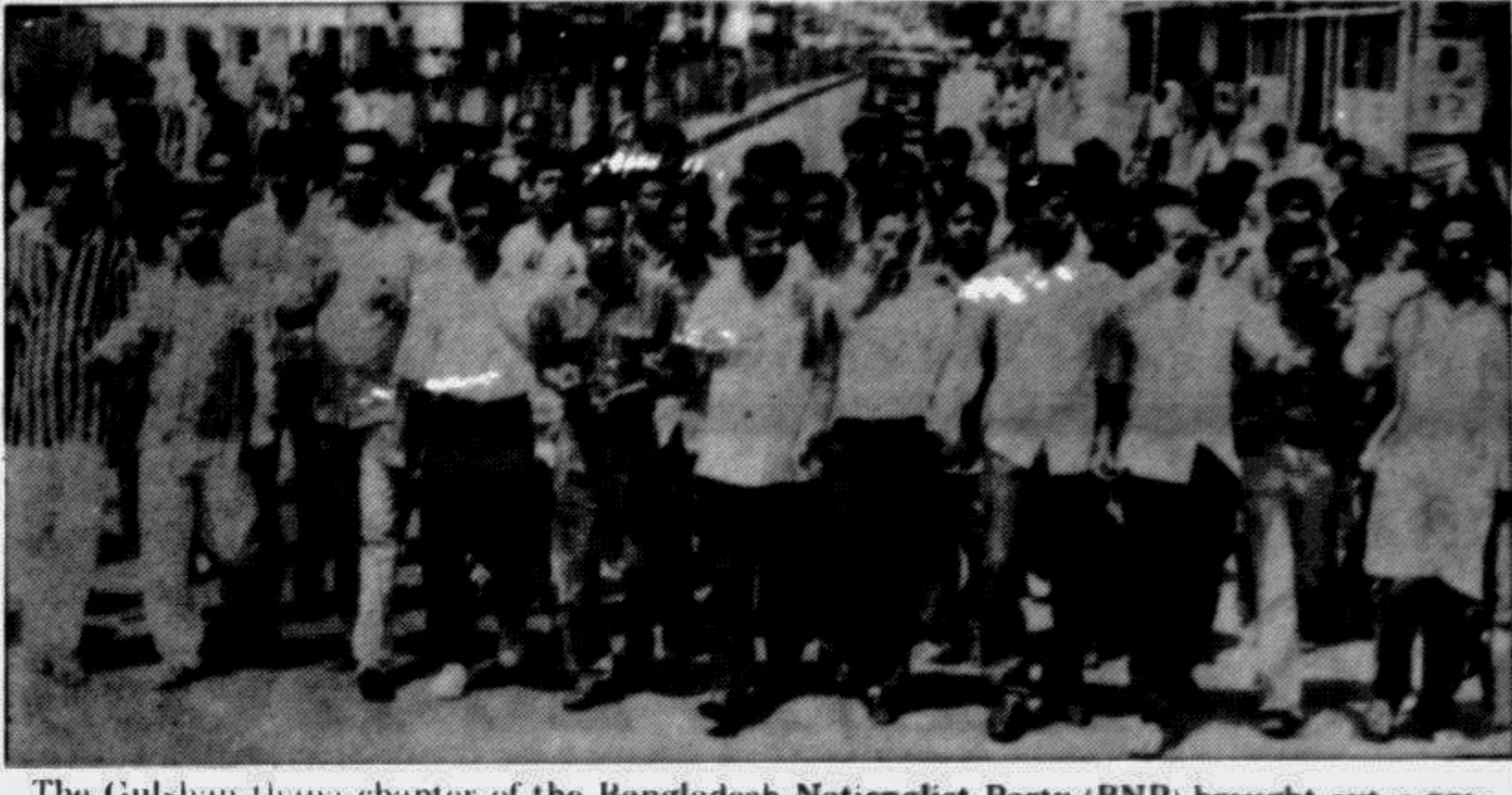
The Gulshan Thana chapter of the Bangladesh Nationalist Party (BNP) brought out a procession in the city's Mahakhali area yesterday protesting the hartal sponsored by the mainstream opposition parties.

If you don't want to go through all this hassle, just go to any street corner and you will find vendors selling kacha aam. (Life is