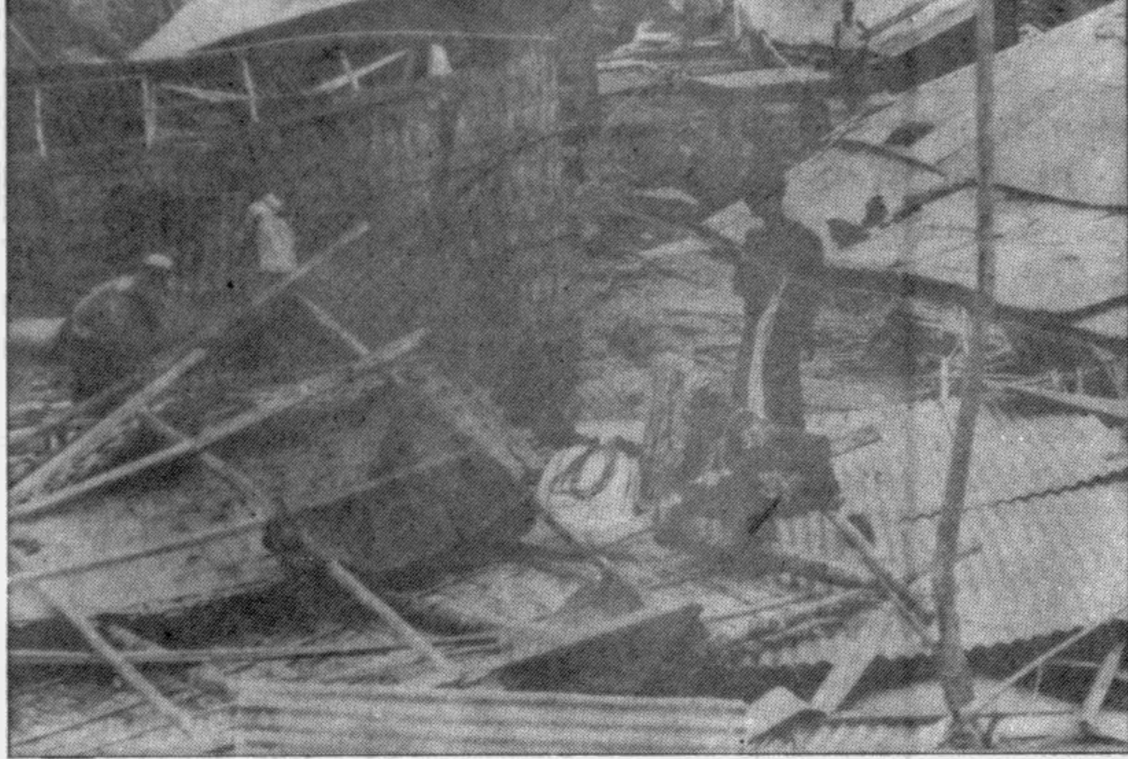
A tornado Saturday evening left hundreds of homes flattened in Louhajang thana of Munshiganj district.