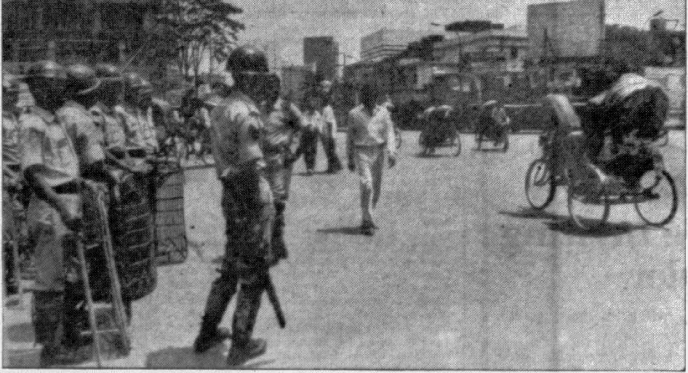
Police maintain vigil in the city's Purana Paltan area during yesterday's hartal hours.

Asked at a briefing at the Foreign Ministry, the spokesman said President Bill Clinton attaches a lot of importance to South Asia and the visit by the First Lady to this region reflected this attitude. He said Bangladesh and the "Grameen Bank" occupied a high priority in the South Asian visit, and it is a well-known fact that the success story of the "Grameen Bank" and the relentless efforts by the people of this country in See Page 12 Col 6