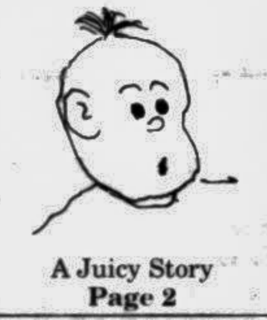
A Juicy Story Page 2