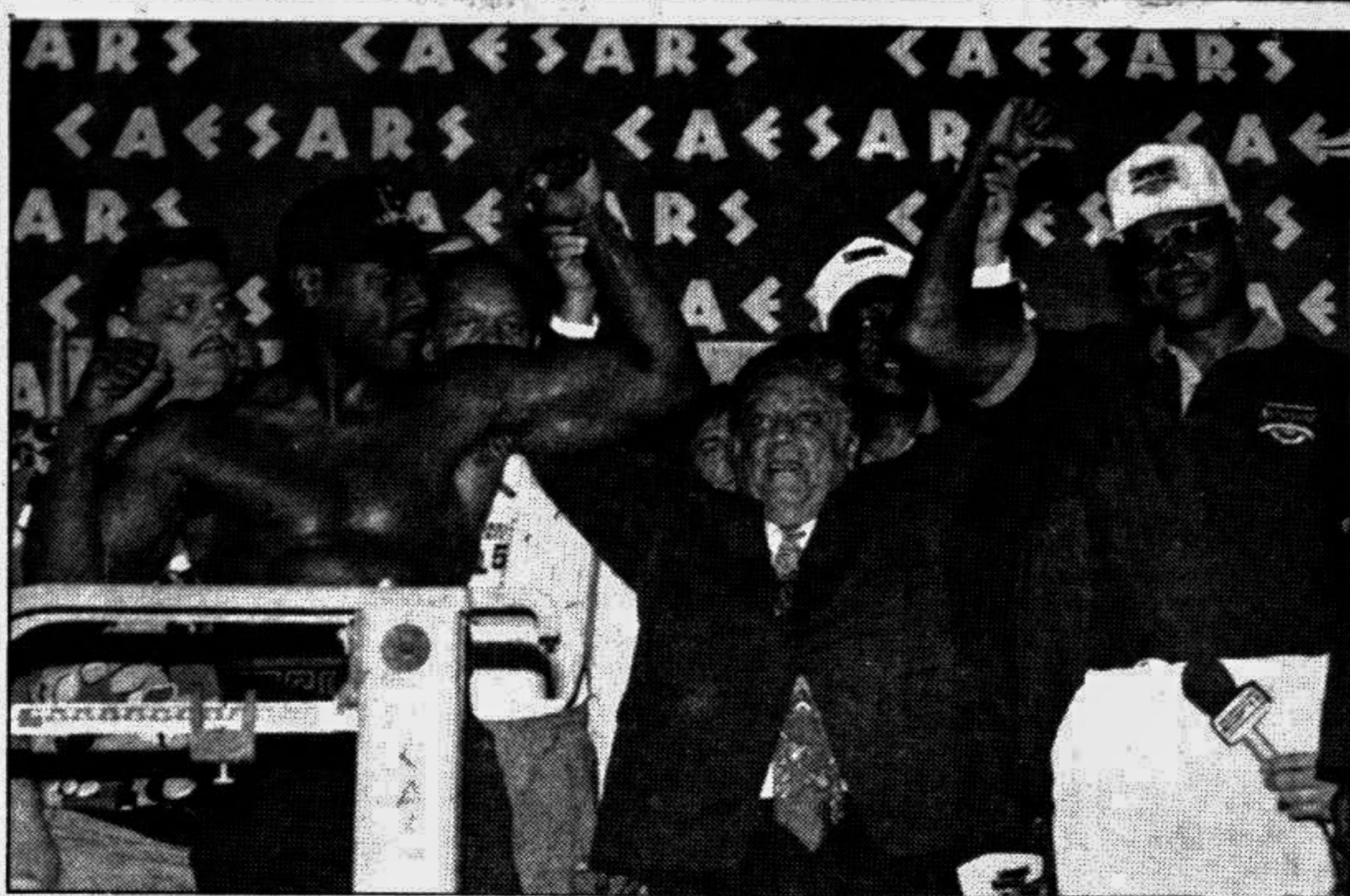
American Oliver McCall (L), the WBC heavyweight champion, casts a challenging look at Larry Holmes on April 7 during the weigh-in for their title bout at Caesars Palace in Las Vegas today.