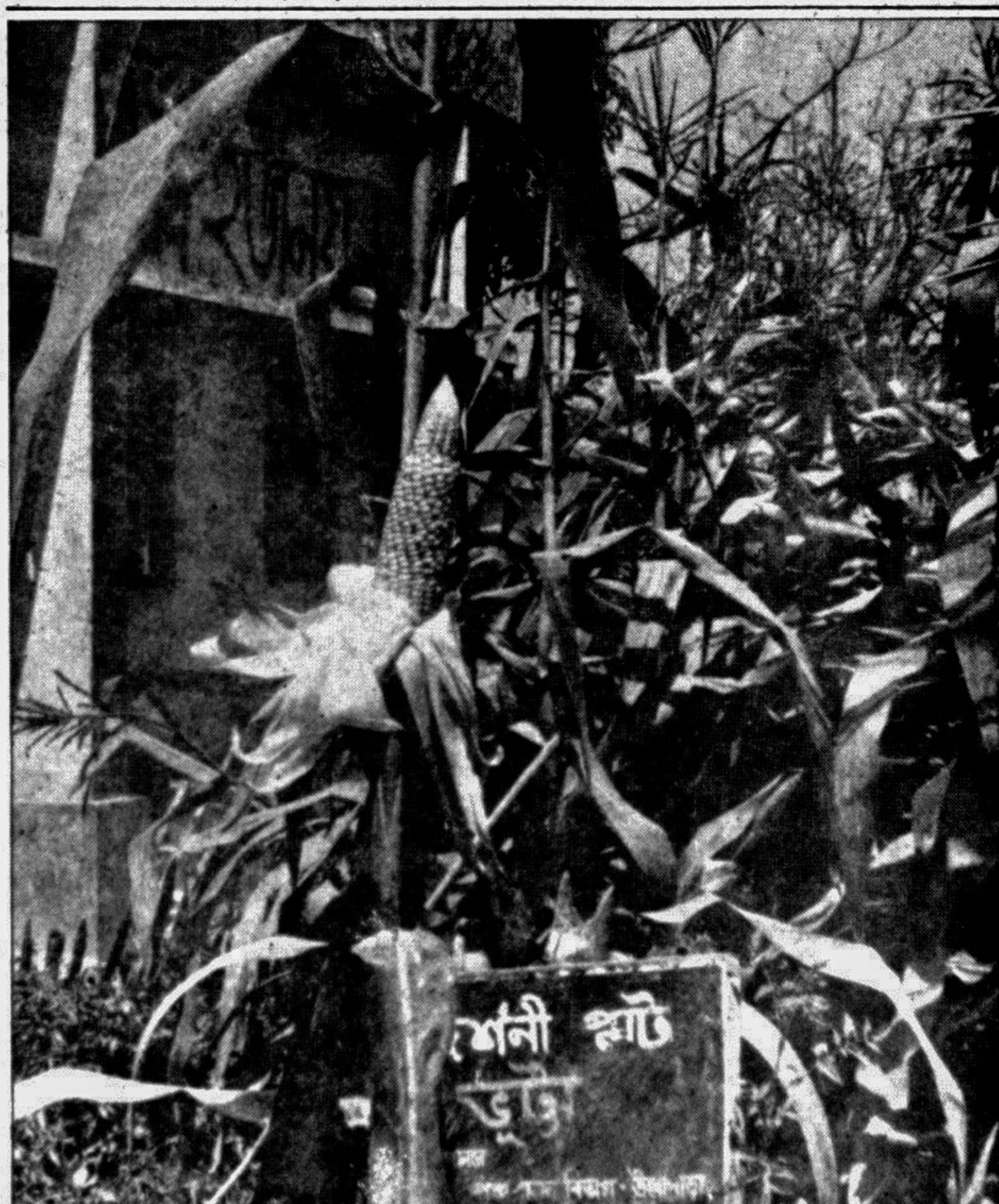
A maize demonstration plot in Ullapara thana of Sirajganj district. The local Agriculture Extension Department (AED) has been demonstrating such plots to local farmers encouraging maize cultivation in the area.

PATUAKHALI, Apr 8: A total of 37 development projects at a cost of Tk 42.50 lakh under Annual Development Programme are nearing completion in Kalapara thana of the district, reports UNB. Of the total, 10 projects will be implemented in irrigation sector, eight in education, seven in communications, four in social welfare, five in maintenance and three in Cottage Industry. Forty per cent work of the projects have already been completed, official sources said.