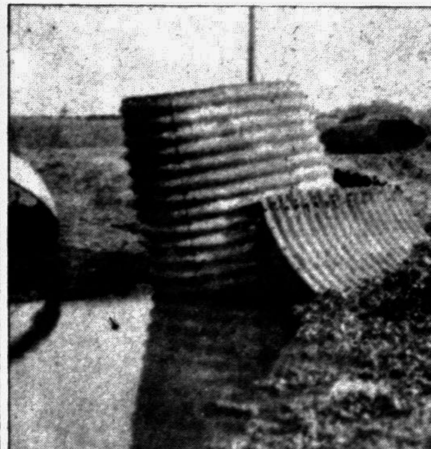
SHERPUR: The picture shows a number of corrugated tins are lying unused by the side of JDK road belonging to Roads & Highways Division. Such tins are reportedly stolen from different places especially on highways which can fetch handsome amount of money. A bundle of such tin cost between Taka 10,000 and 12,000 in the local market.

The affected families are now residing under open sky and sought government help.