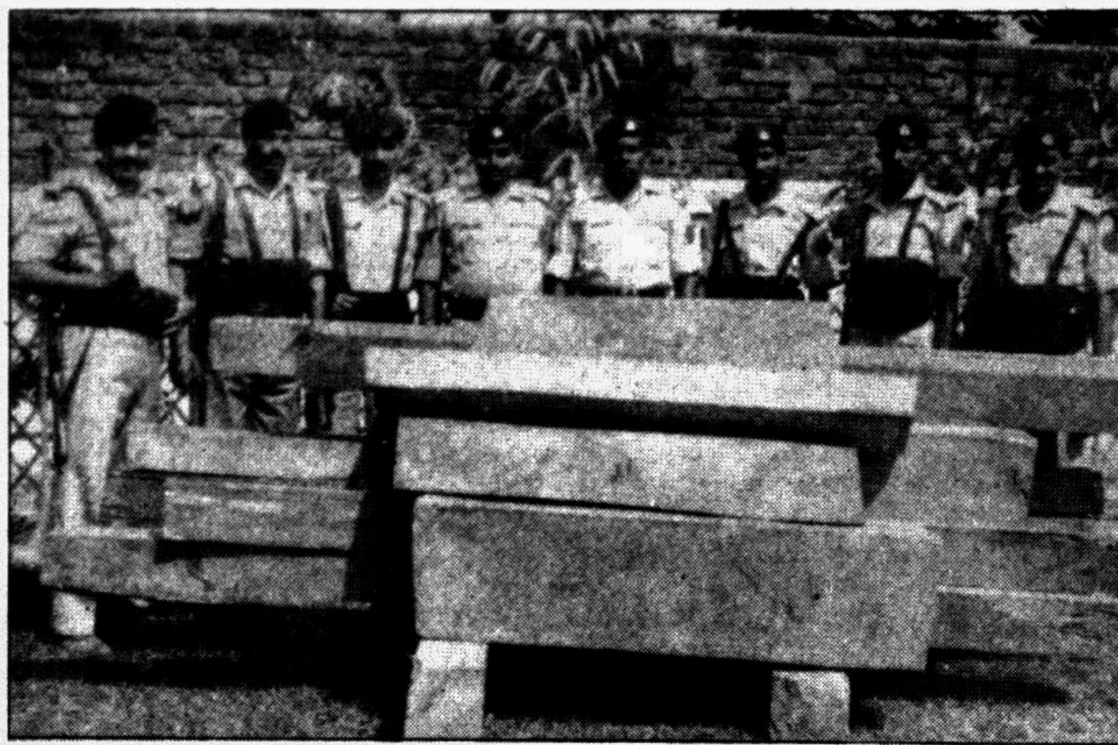
BRAHMANBARIA The BDR of 23 battalion launching an anti smuggling drive at the adjacent areas of the Brahmanbaria Rail-Station on March 25, seized 51 cubic feet of Indian log wood worth about Tk 51 thousand.

A total of 2965 leprosy patients have been cured by the treatments of HEED from 1976 to 1994, while 671 patients are now under treatment and 522 new victims have been detected as leprosy patients from January 1994 to February 1995.