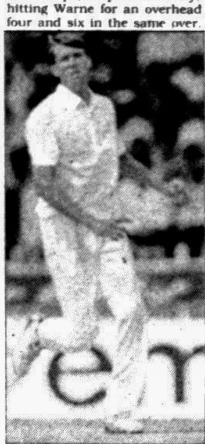
McGrath ... m-o-m

But only one round has gone. There are still three Test matches left and we're going to look to bounce back." Australia made early inroads into the West Indies batting when they resumed from their overnight 13 without loss, facing a first innings deficit of 151. In the day's third over, Shervin Campbell, the diminutive 24-year-old Barbadian in only his third Test, pulled a long hop from Warne straight to short mid-wicket, where Steve Waugh held the catch on the second attempt, falling back. In the next over, Campbell's opening partner, Stuart Williams (10) edged an ambitious Waugh square cut to wicketkeeper Ian Healy off McGrath. McGrath struck the key blow just six runs later, when he induced an edge from left-hander Lara, and Healy again jubilantly accepted the catch. The first innings leading scorer and world record-holder made just nine. In crisis at 31 for three, Carl Hooper responded boldly, hitting Warne for an overhead four and six in the same over.