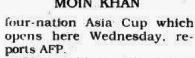
MOIN KHAN four-nation Asia Cup which opens here Wednesday, reports AFP.