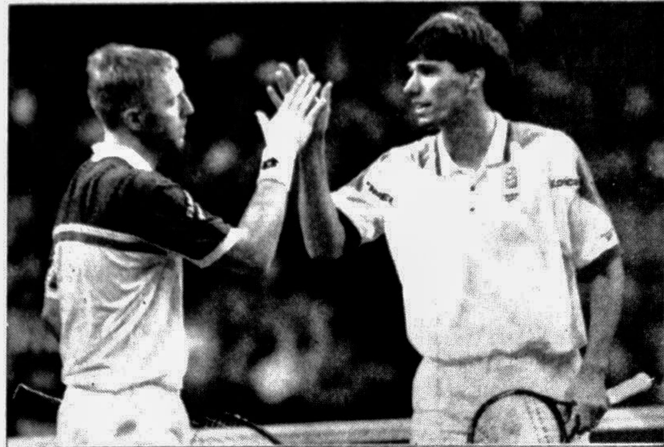
German Davis Cup double pair Boris Becker (L) and Michael Stich congratulate each other after winning the quarterfinal match against Dutch pair Paul Haarhuis and Jacco Eltingh in Utrecht, Netherlands on Apr 1. The Germans won 6-7 (7-1), 4-6, 6-4, 7-5, 6-3.