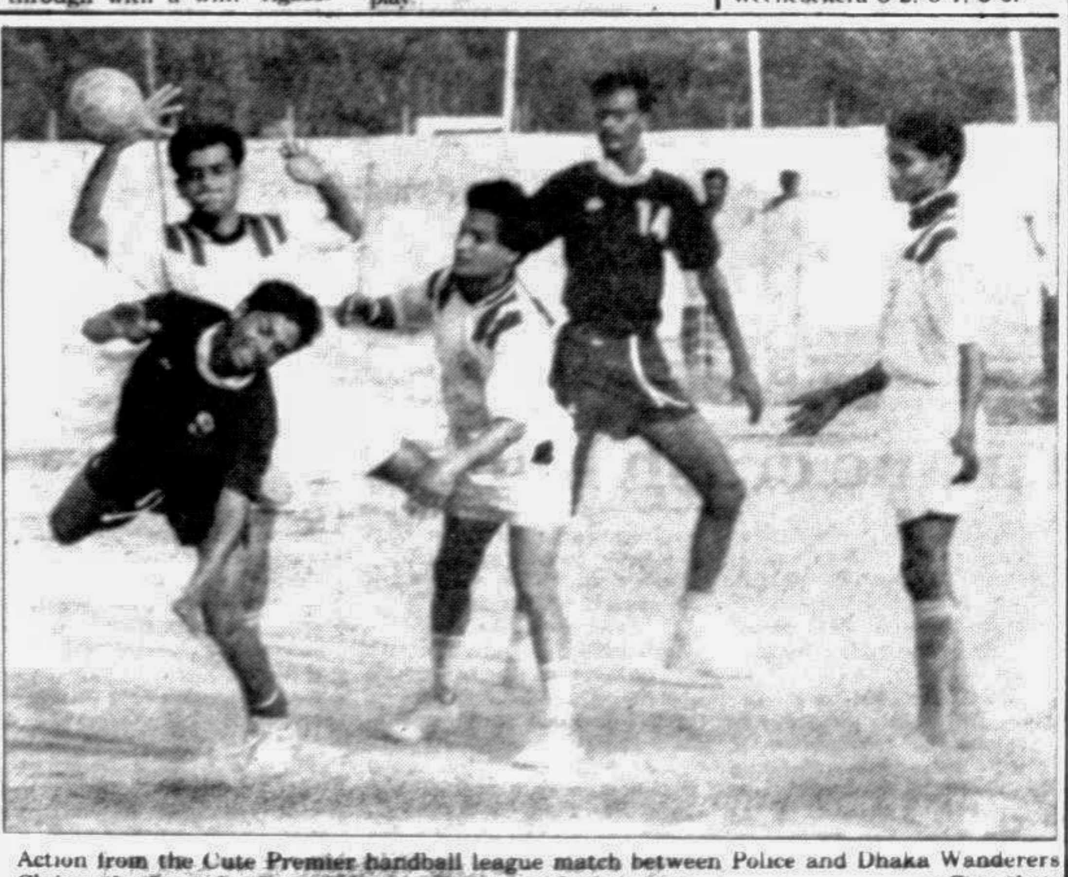
Action from the Cute Premier handball league match between Police and Dhaka Wanderers Club at the Outer Stadium yesterday. Police won 38-9.