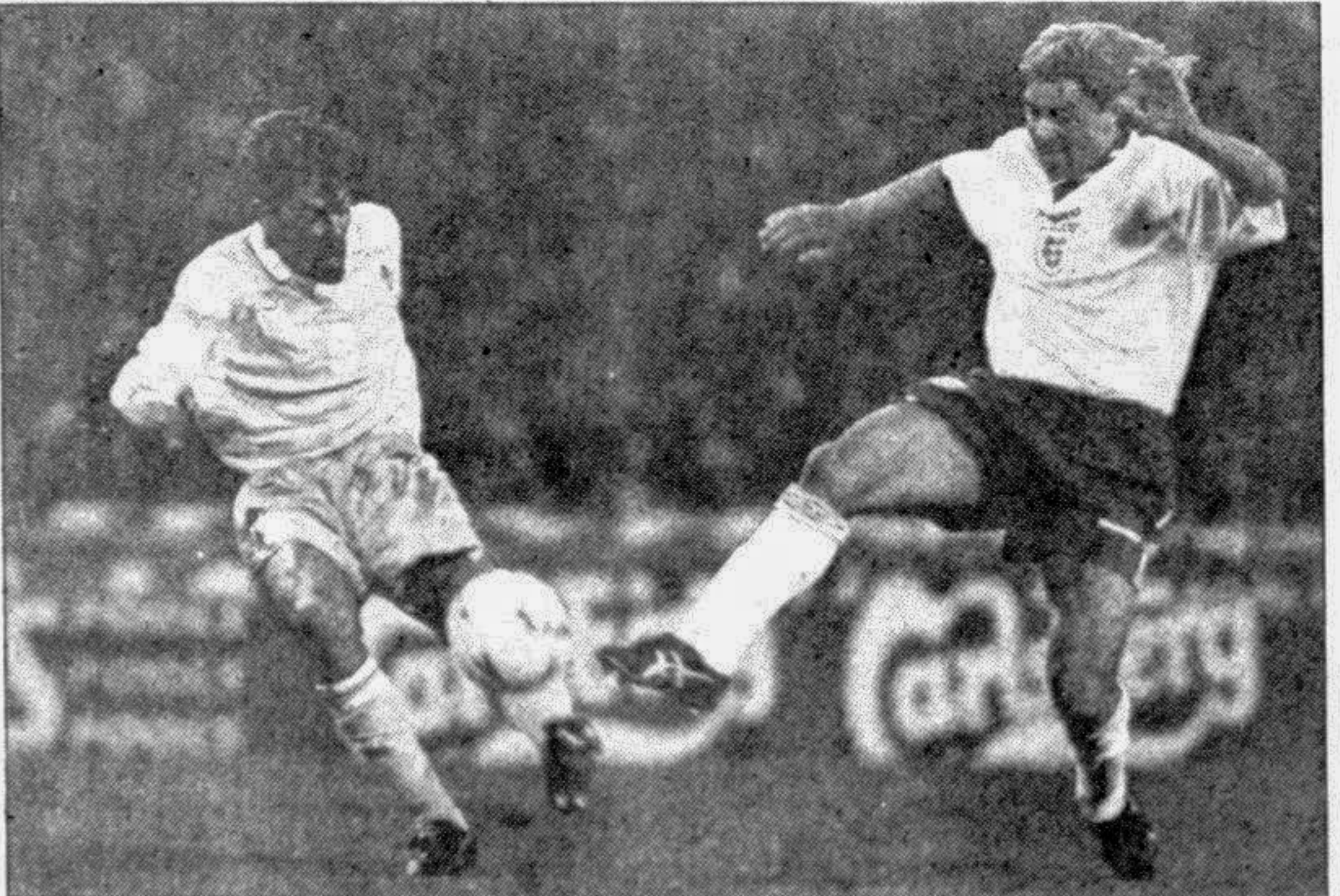
Uruguay's Daniel Fonseca (L) and England's Barry Venison fight for the ball during a friendly at the Wembley Stadium on Wednesday. The match ended with a goalless draw.