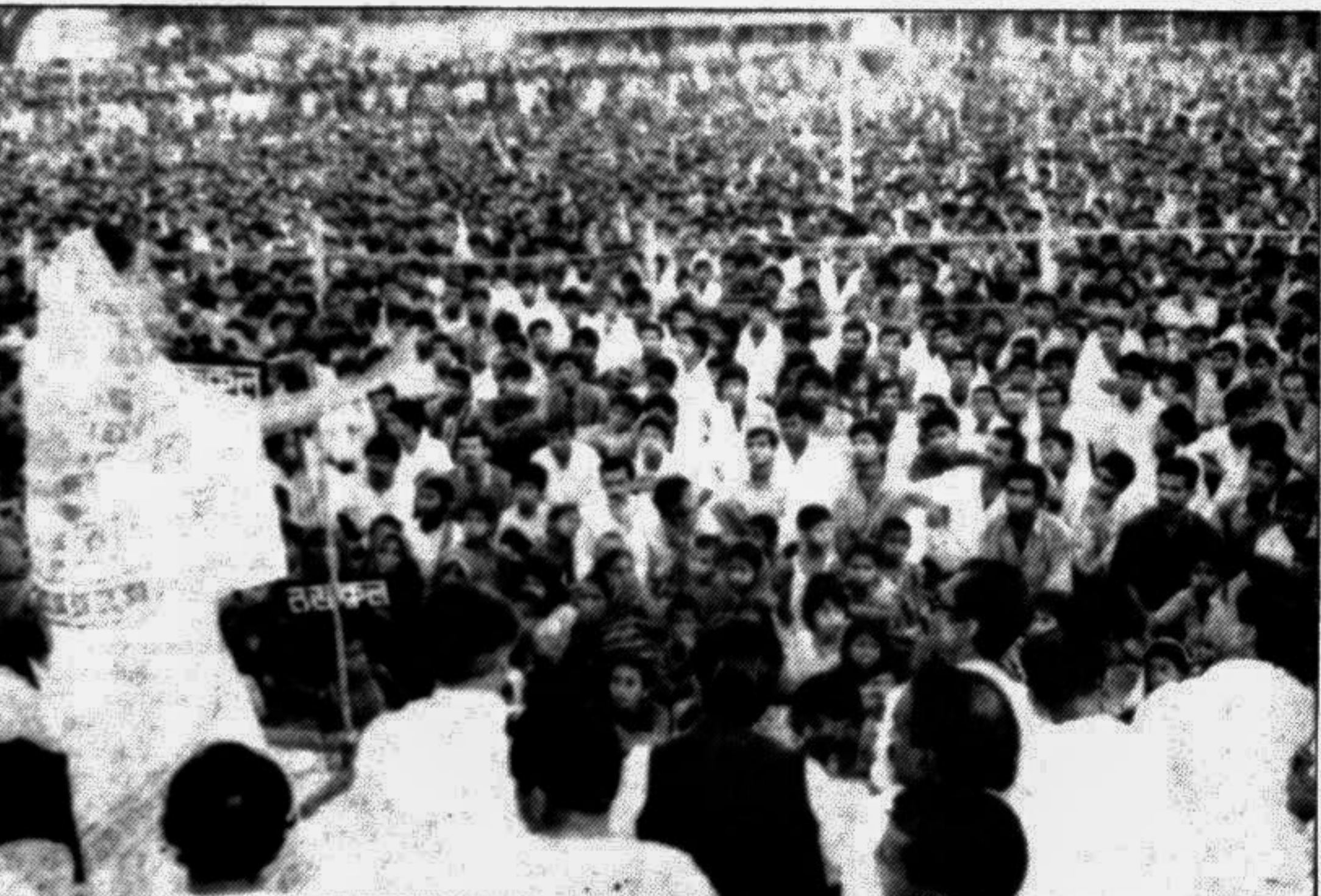
Awami League chief Sheikh Hasina addressing a public meeting at the Nazrul College ground in Trishal yesterday.