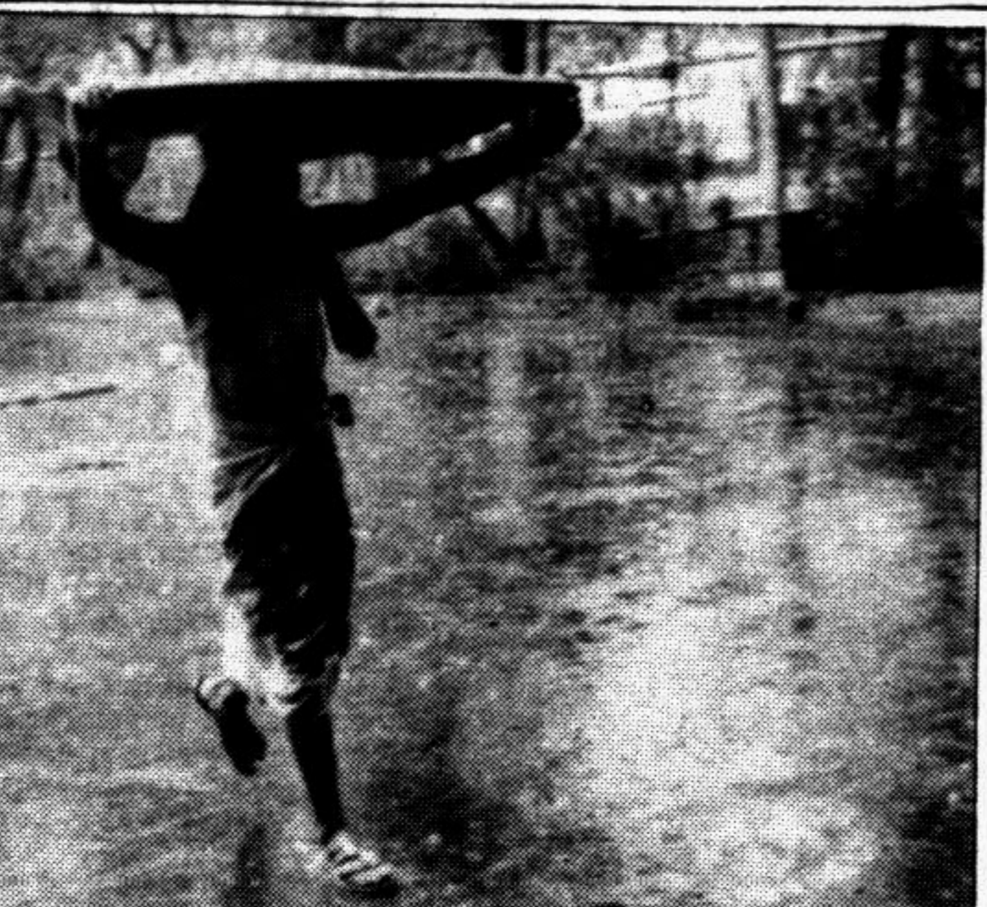
A WELCOME RELIEF: A man covers his head as he walks during yesterday afternoon's light drizzle in the city.

The highest rainfall of 27mm was recorded at Maidje Court, while 7mm fell at Conilla, 5 mm at Feni and 2 mm at Rangmat.