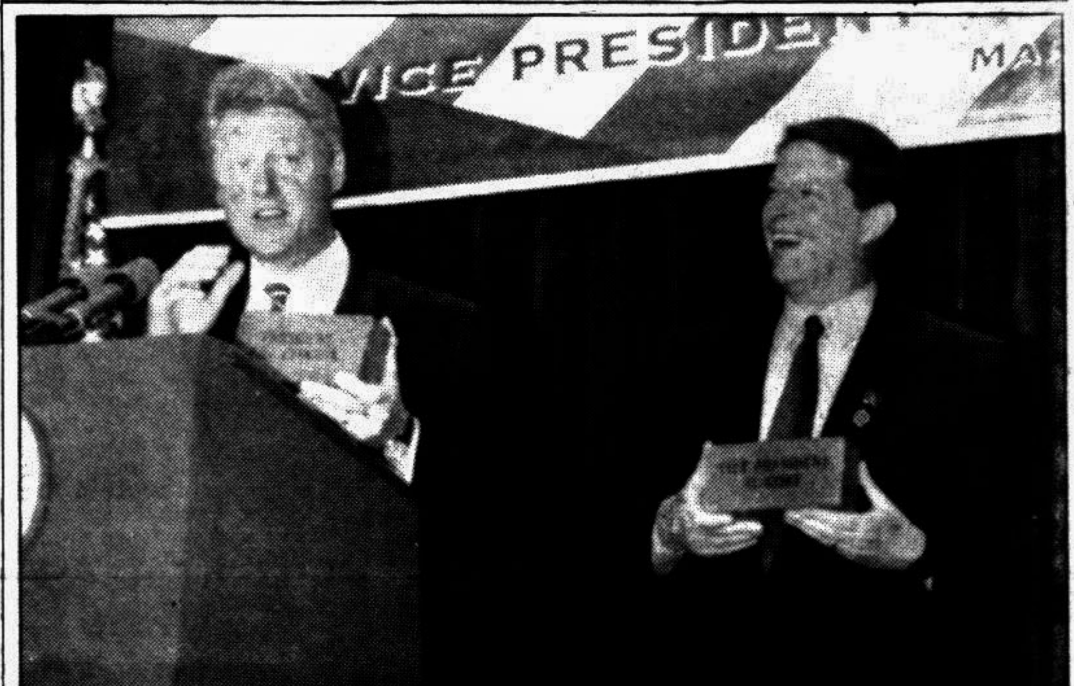
US President Bill Clinton and Vice President Al Gore show the bricks with their names on it at the Atlanta Committee for the Olympic Games headquarters in Atlanta on Mar 28. The bricks will be placed in the Olympic Park that is currently under construction. Clinton and Gore are in town for a regional economic summit.

Tapie has also appealed to the Supreme Court of Appeal against being declared a bankrupt and the hearing was fixed for Friday.