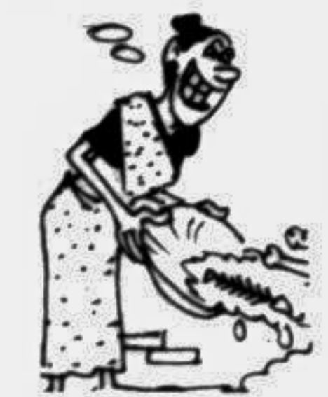
Spitting Spree All Around Page 3