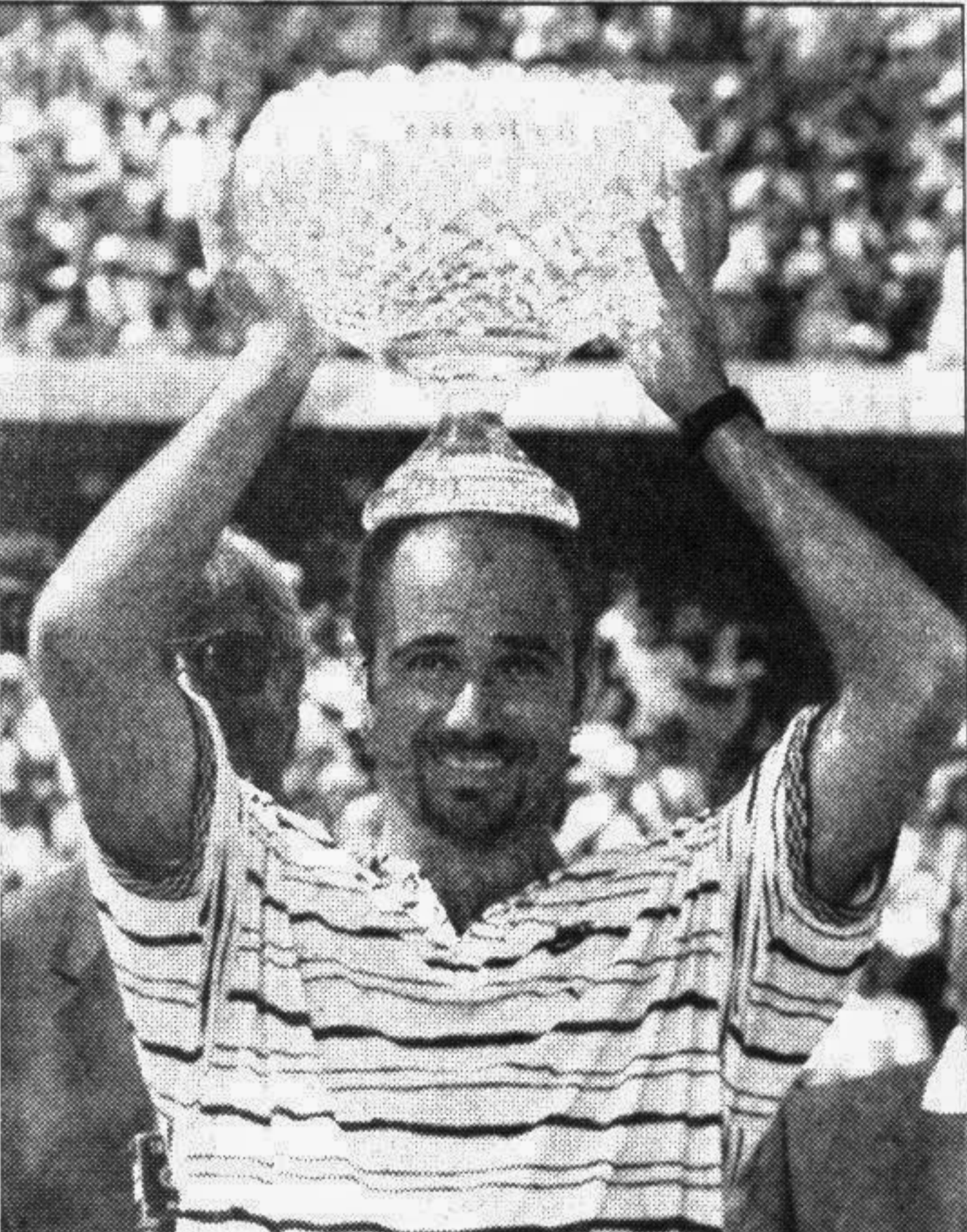
American Andre Agassi holds aloft the trophy after defeating Pete Sampras in men's singles final of the Lipton Championships in Key Biscayne, Florida on Sunday. Agassi won 3-6, 6-2, 7-6 (7-3).

KEY BISCAYNE, Florida, Mar 27: Andre Agassi closed in on Pete Sampras' world number-one ranking here Sunday after chalking up a 3-6, 6-2, 7-6