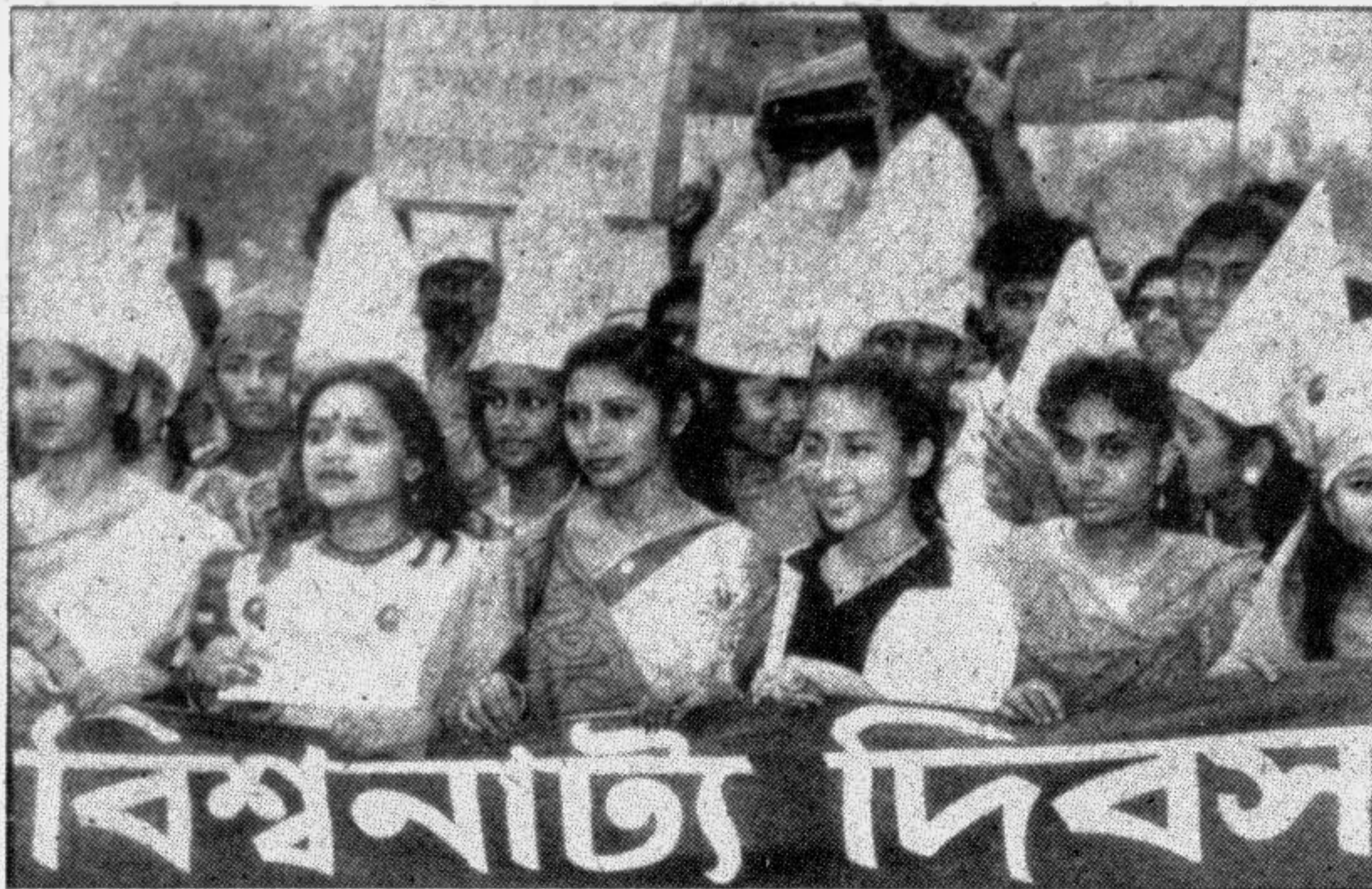
The Bangladesh Group Theatre Federation brought out a procession in the city yesterday to mark the World Theatre Day.