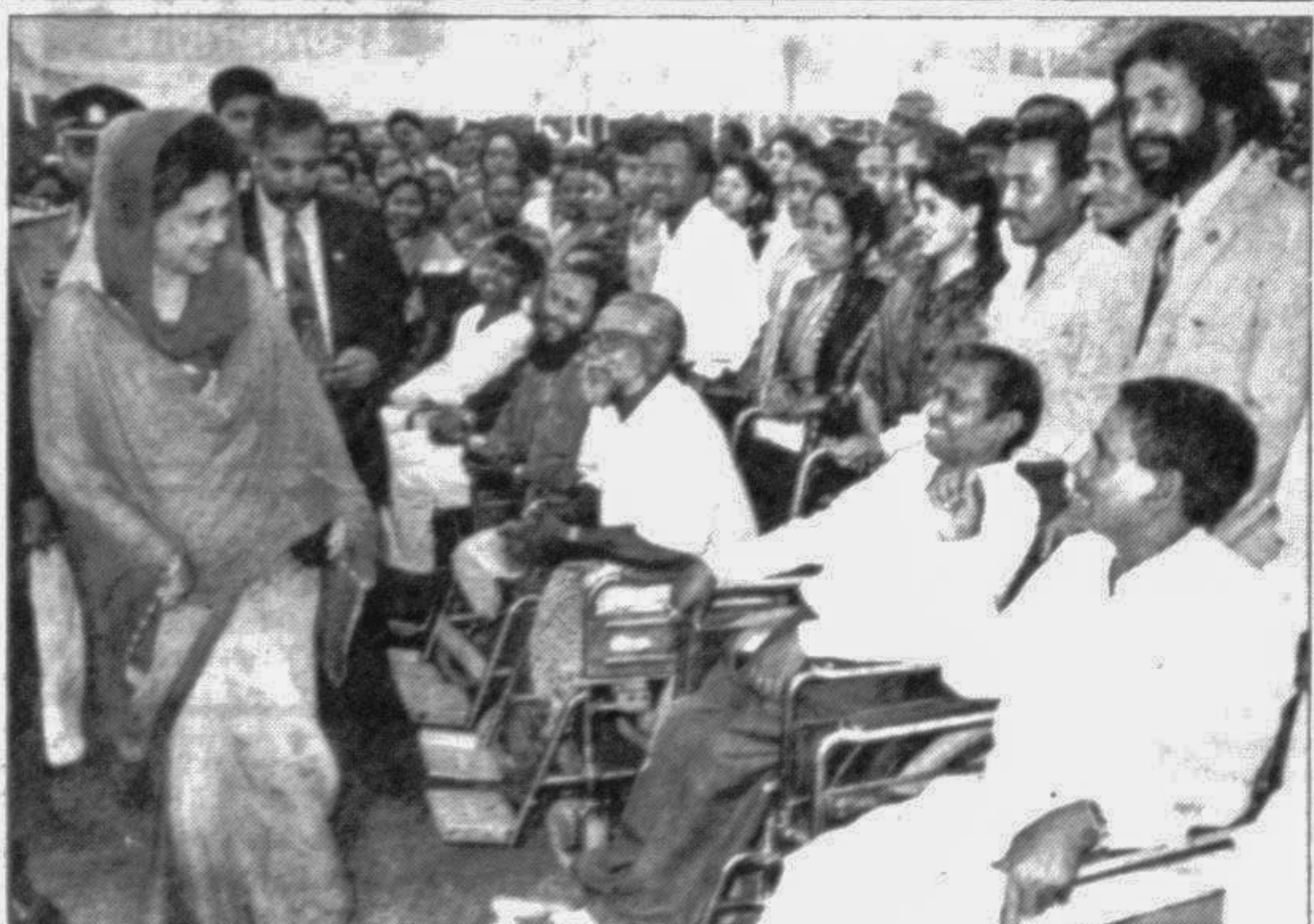
Prime Minister Begum Khaleda Zia exchanging greetings with crippled freedom fighters at a reception at Bangabhaban on Independence and National Day Sunday.

Hillary Clinton is scheduled to fly to Dhaka from Kathmandu on April 2. Her entourage of around 50 members include a 16-member media team.