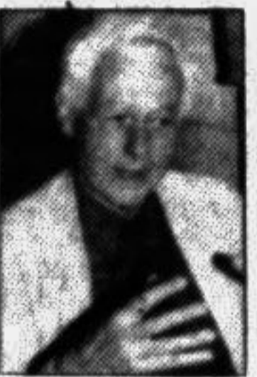
Illustration is Like Magic Page 3