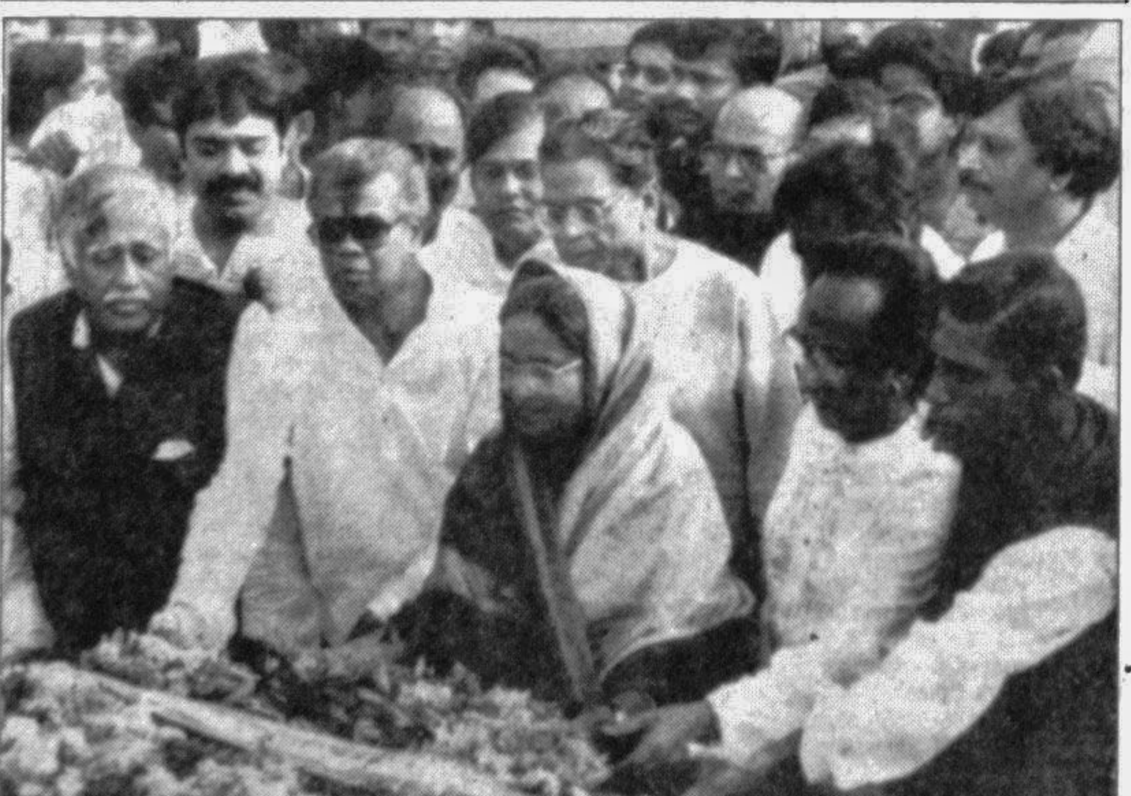
Awami League chief Sheikh Hasina and senior party colleagues placing wreath at the Jatiya Smriti Soudha in Savar on Independence and National Day Sunday.