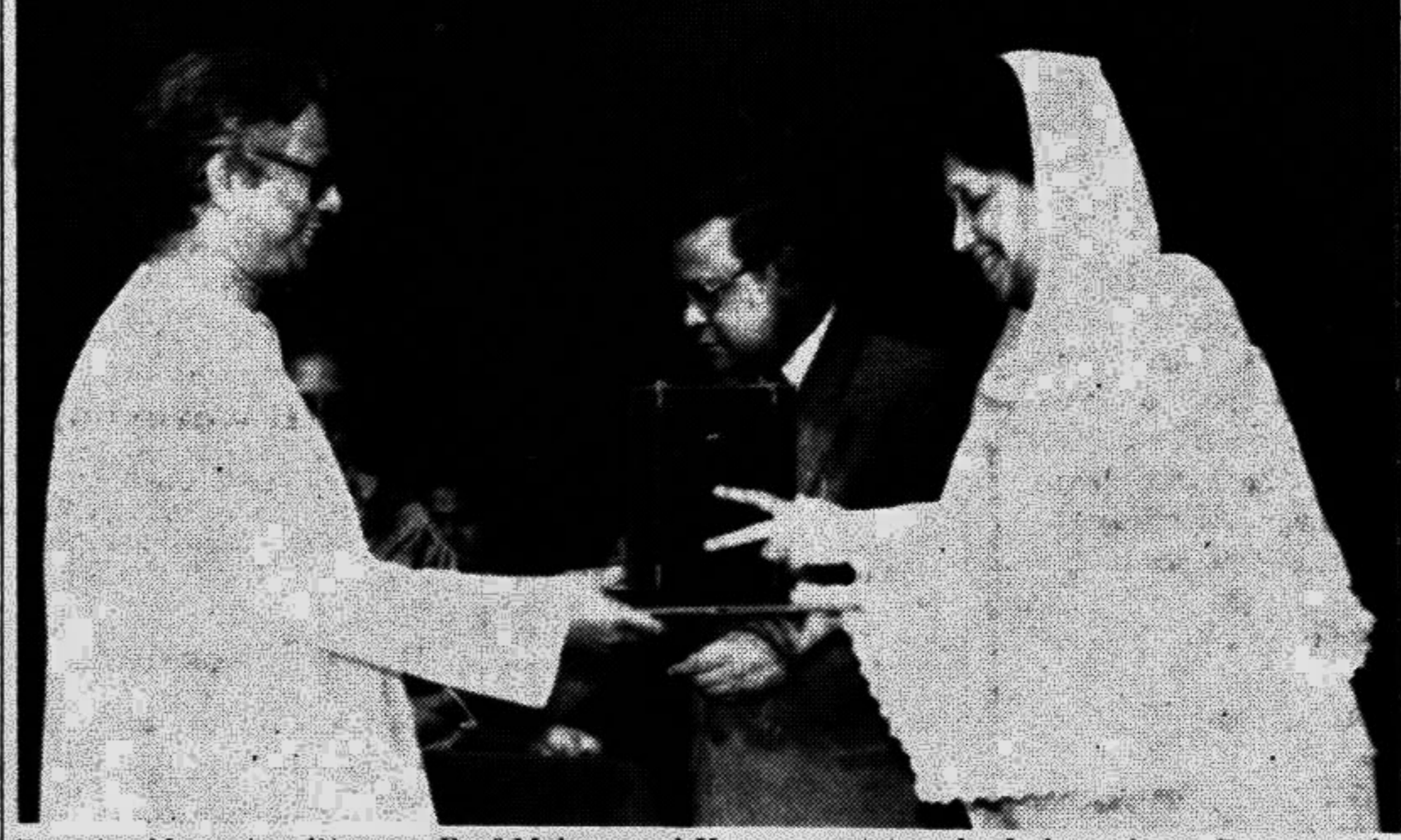
Founder-Managing Director Prof Mohammad Yunus receiving the Independence Day Award 1994 for the Grameen Bank from Prime Minister Begum Khaleda Zia at the Osmany Memorial Hall in the city yesterday.

Star Report The country's export earnings during the first six months of 1994-95 stood at 1790.79 million US dollars, showing an increase of 39.12 per cent over that of the corresponding period of the previous fiscal. According to the latest data released by the Export. See Page 11 Col. 6