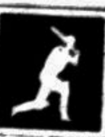
PORT OF SPAIN, Trinidad, Mar 24 (AP): Both athletes have specialty shoes created for them and reported seven-figure paychecks to show for it.