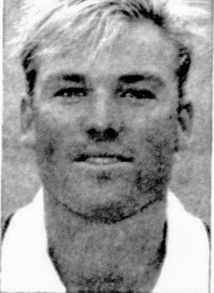
SHANE WARNE too slow and too short. "When I got the axe, I thought, what do I do now? I didn't want to work." So Warne signed on with a pro cricket team in England, then landed a sport on the Victoria state squad in 1990. Dropped after one season, he played on a youth team for a year and was called back up to the state team for four games before the national team grabbed him for the 1991 series against India. "The going was rocky. I got smashed all over the park," confessed Warne. "I got dropped to 12th man," the