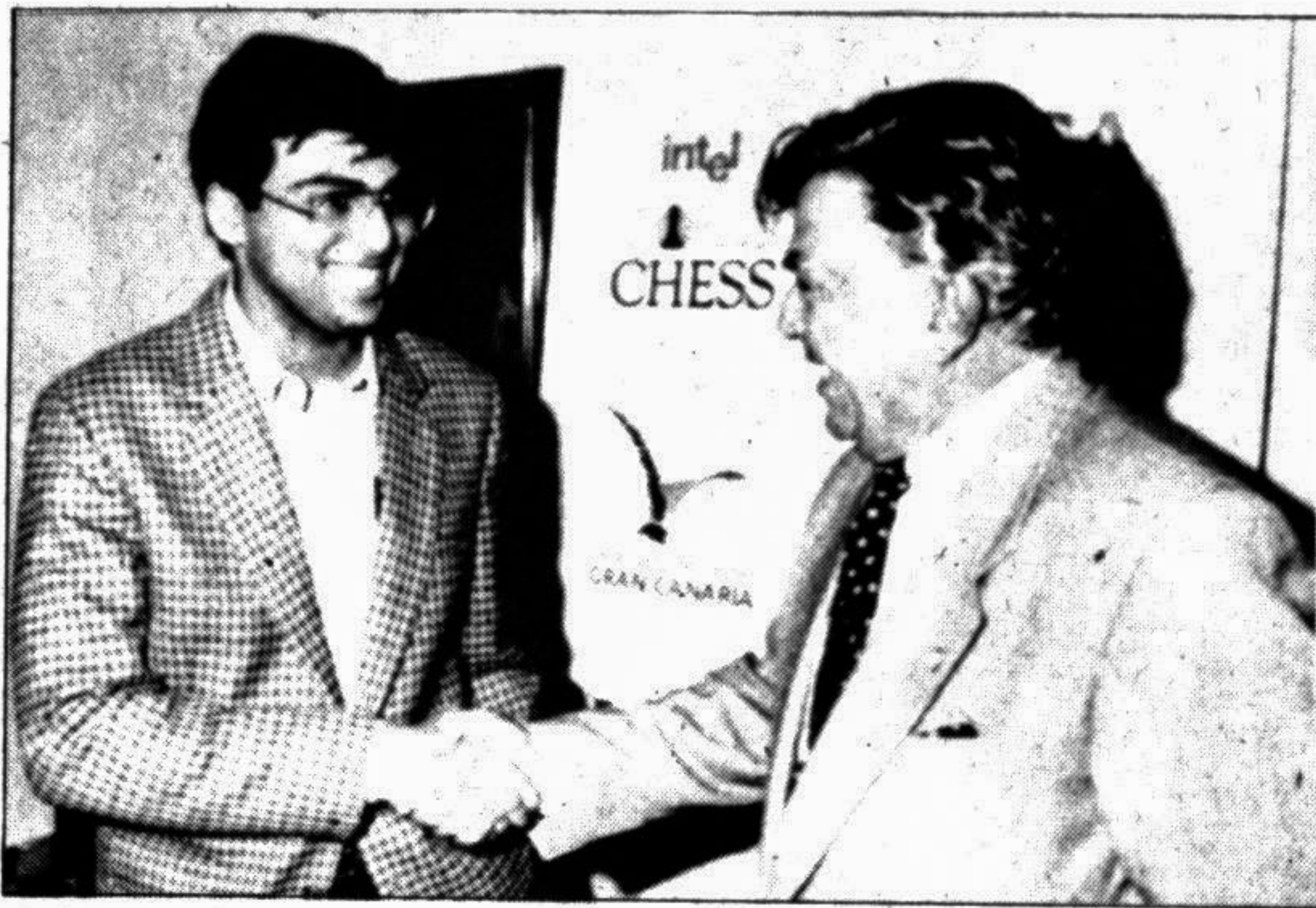
Indian Grandmaster Viswanathan Anand (L), who beat his American counterpart Gata Kamsky in the PCA candidates final series, is congratulated by Canarias Tourism president in Las Palmas on Thursday.