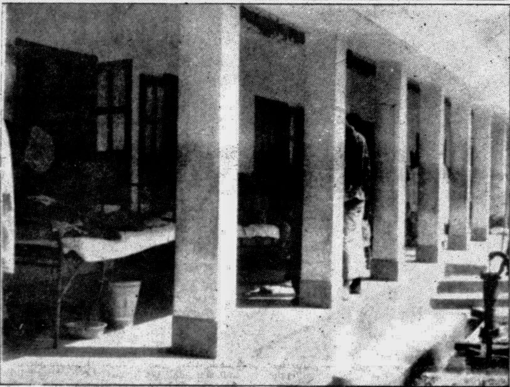
Patients at the Sirajganj sadar hospital accommodated on the corridor of the hospital.

RAJBARI, Mar 24: Left Democratic Front (LDF) Tuesday brought out a militant procession in the town protesting price hike of essential commodities, including rice, paper and fertilizer, reports UNB. Witnesses said, the LDF activists laid a siege in front of DC office and submitted a memorandum to the Deputy Commissioner demanding adequate supply of fertilizer.