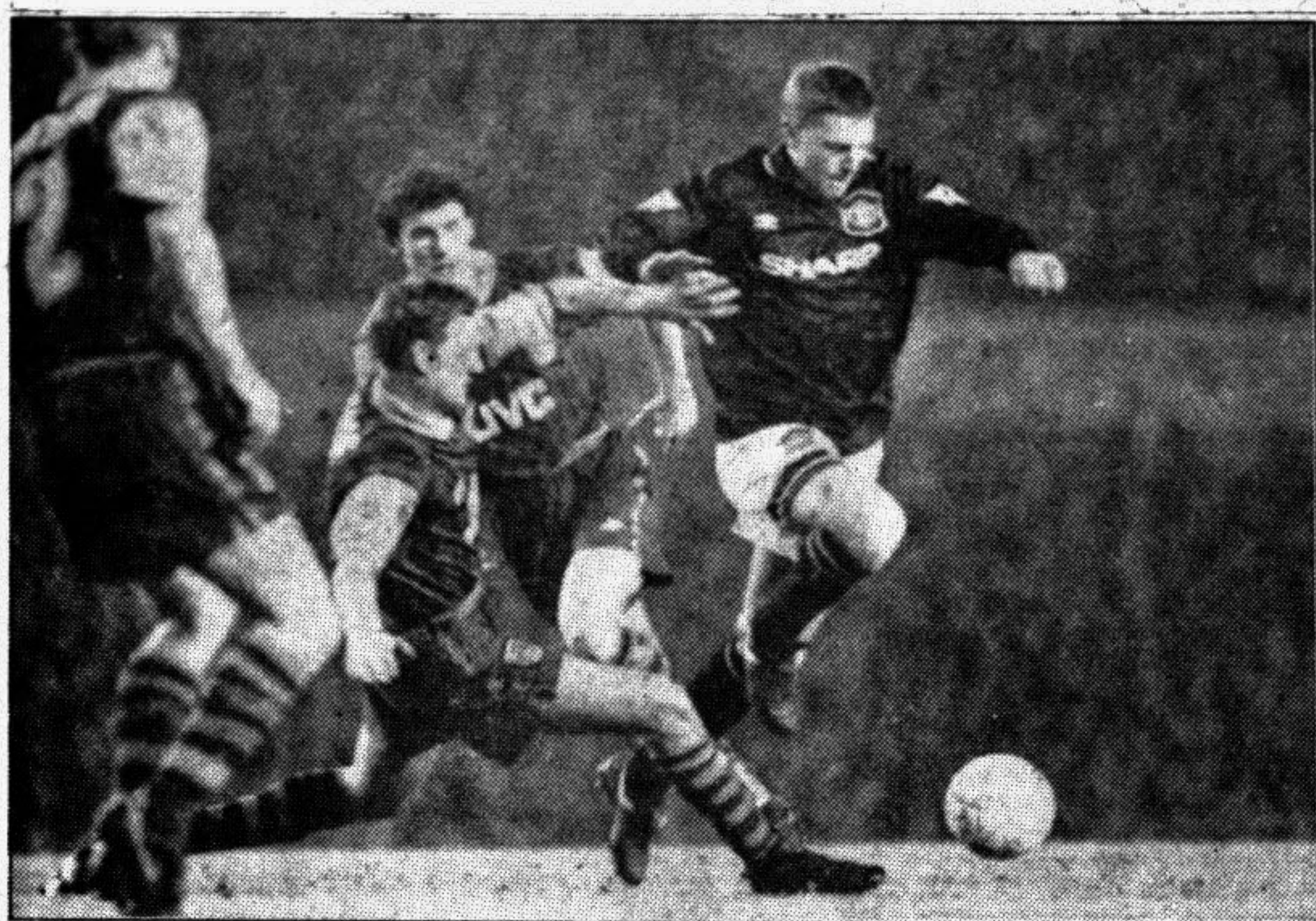
Manchester United's Lee Sharpe (R) evades a tackle by Arsenal's Tony Adams during their FA Cup sixth round replay at Old Trafford on Mar 22. United won 3-0.

South Korea is resisting the idea, offering instead to allow North Korea to co-host the World Cup, saying that the prospect of such cooperation in itself could hasten reunification of the football-mad peninsula.